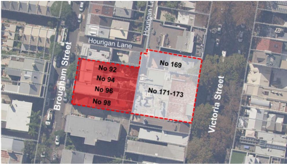
Figure 2: Site Identification Plan