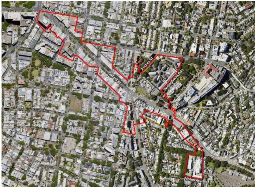
Figure 1 the boundaries of the Oxford Street cultural and creative precinct