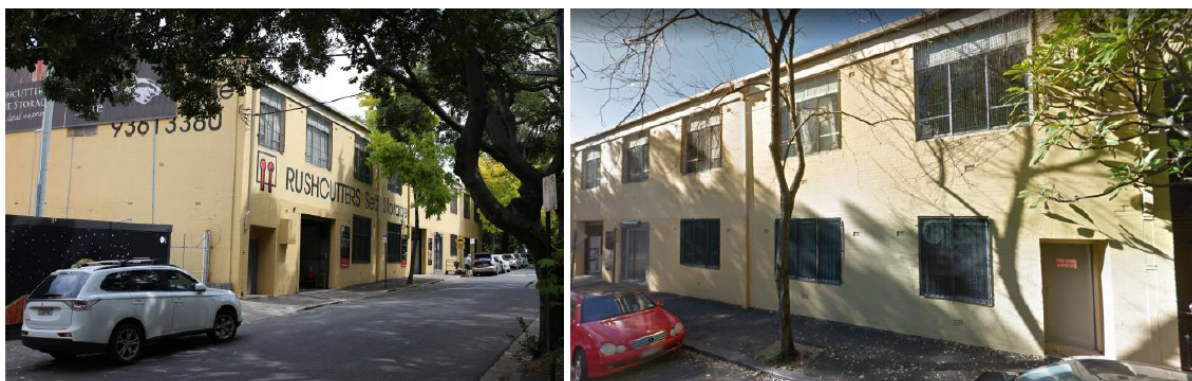
Figure 3: Photographs of the site and existing building, (L-R) looking south and looking north-east