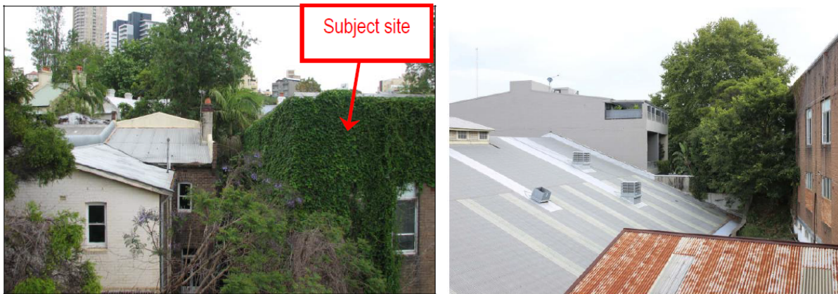
Figure 5: Residential interface with site, (L-R) 2 storey terraces to south-east of site and view towards four storey residential building to south of site