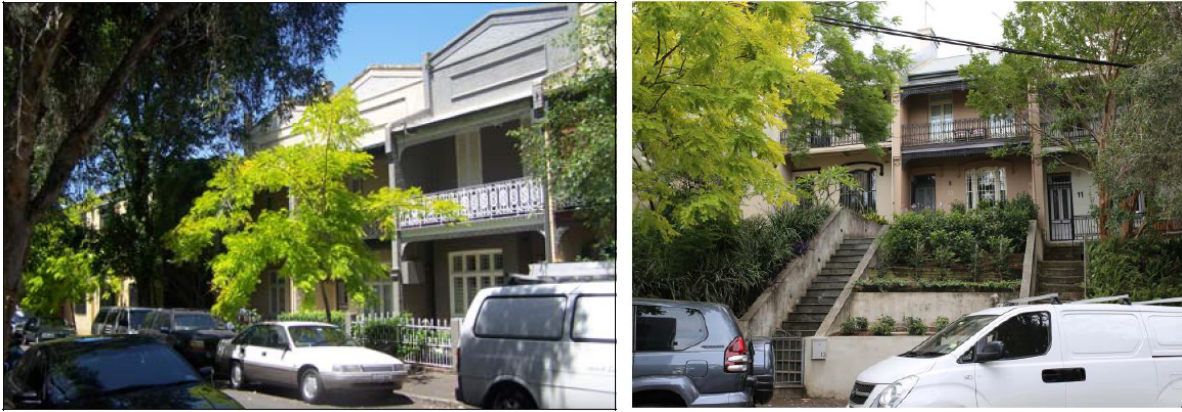
Figure 4: Adjoining residential terraces, (L-R) to immediate south of site along Barcom Ave and heritage items on the opposite side of Barcom Ave within the conservation area