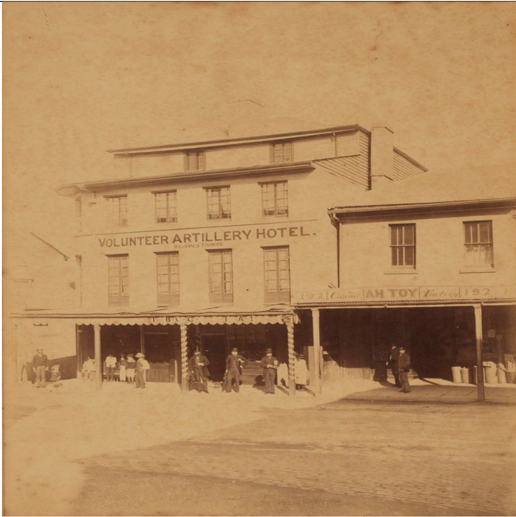
Ah Toy's Cabinet Factory, 192 Lower George Street.

Date: c.1885 Source: State Library of NSW,