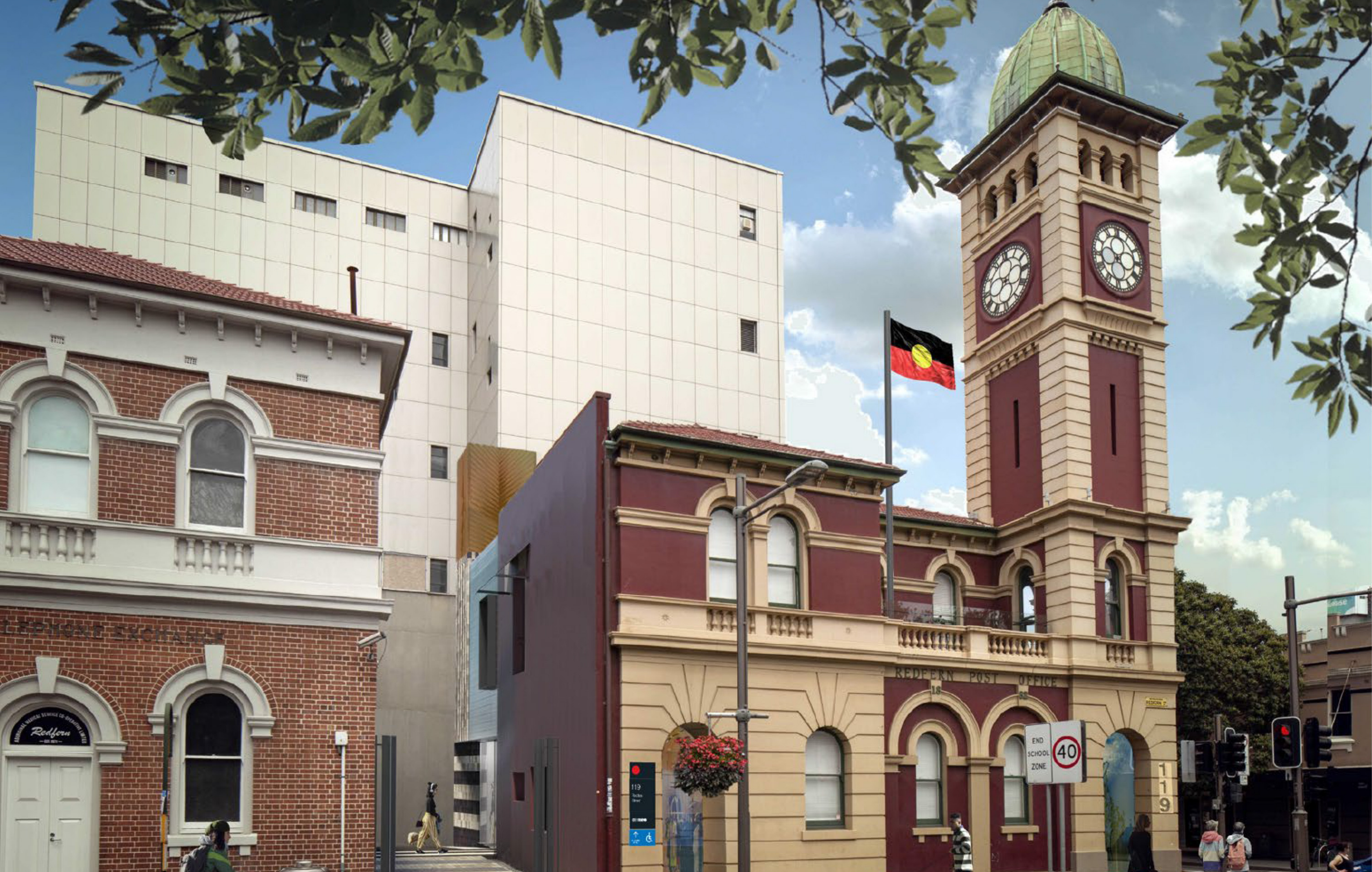
119 Redfern Street, Redfern (artist's impression of new entrance from Redfern Street)