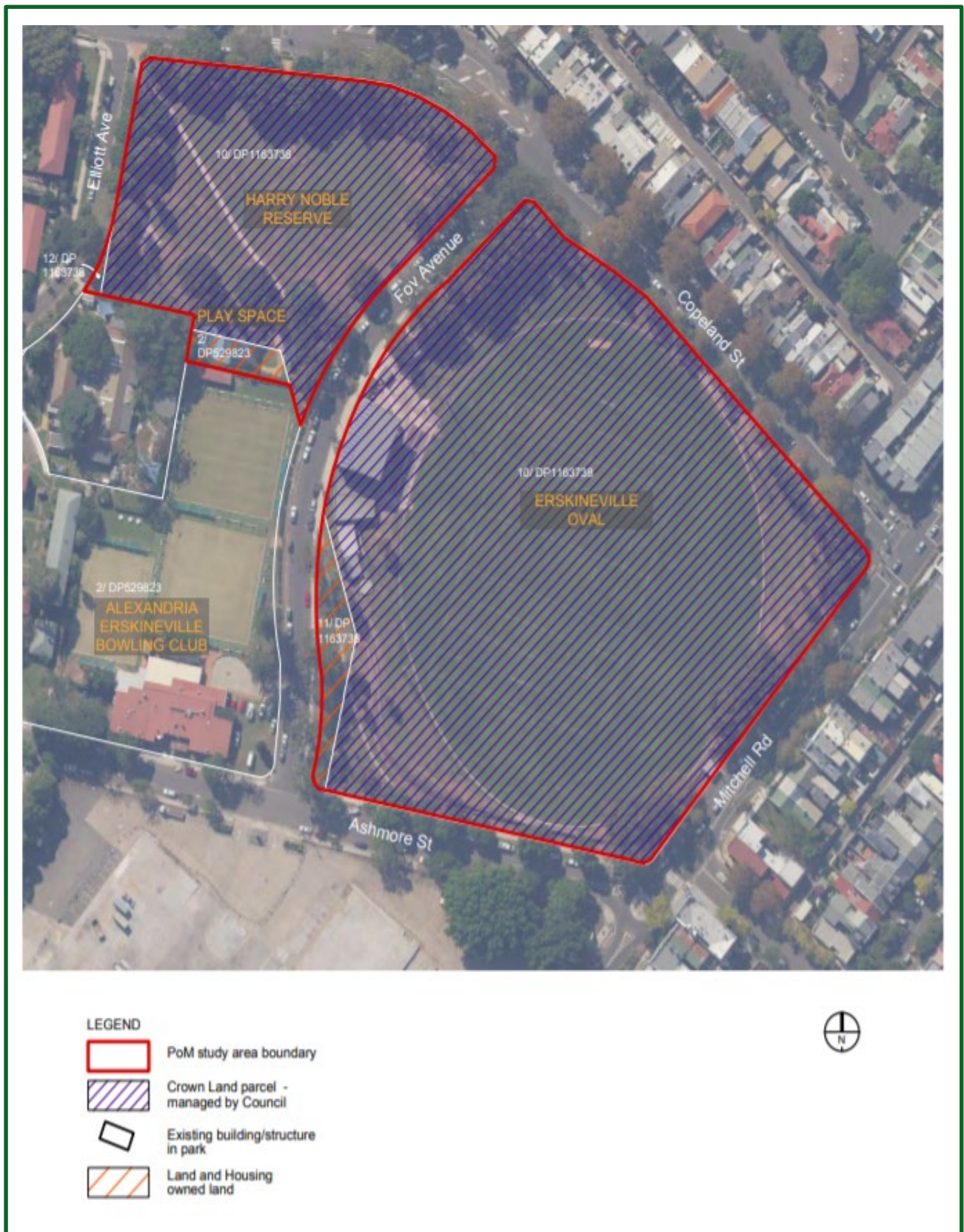
Figure 2. Site Plan