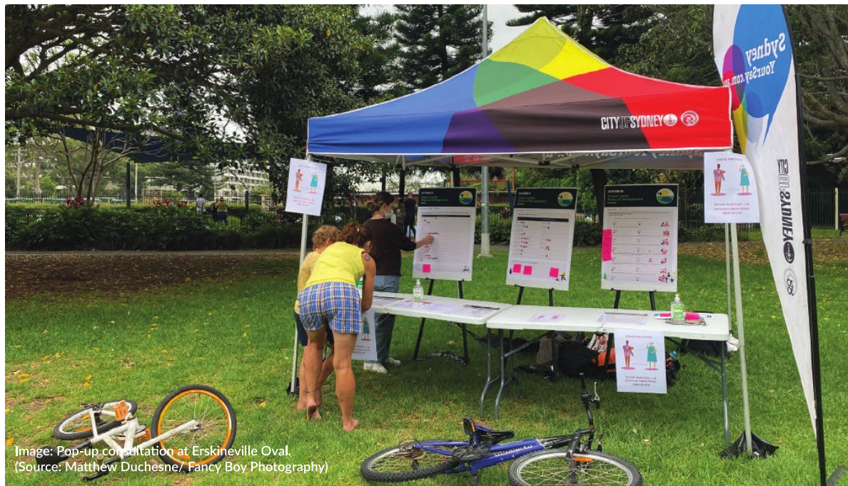
Image: Pop-up consultation at Erskineville Oval.