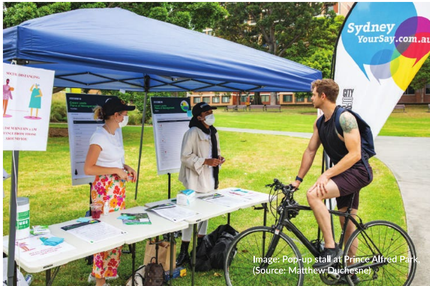
Image: Pop-up stall at Prince Alfred Park