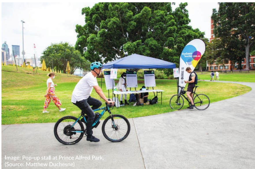
Image: Pop-up stall at Prince Alfred Park, (Source: Matthew Duchesne)