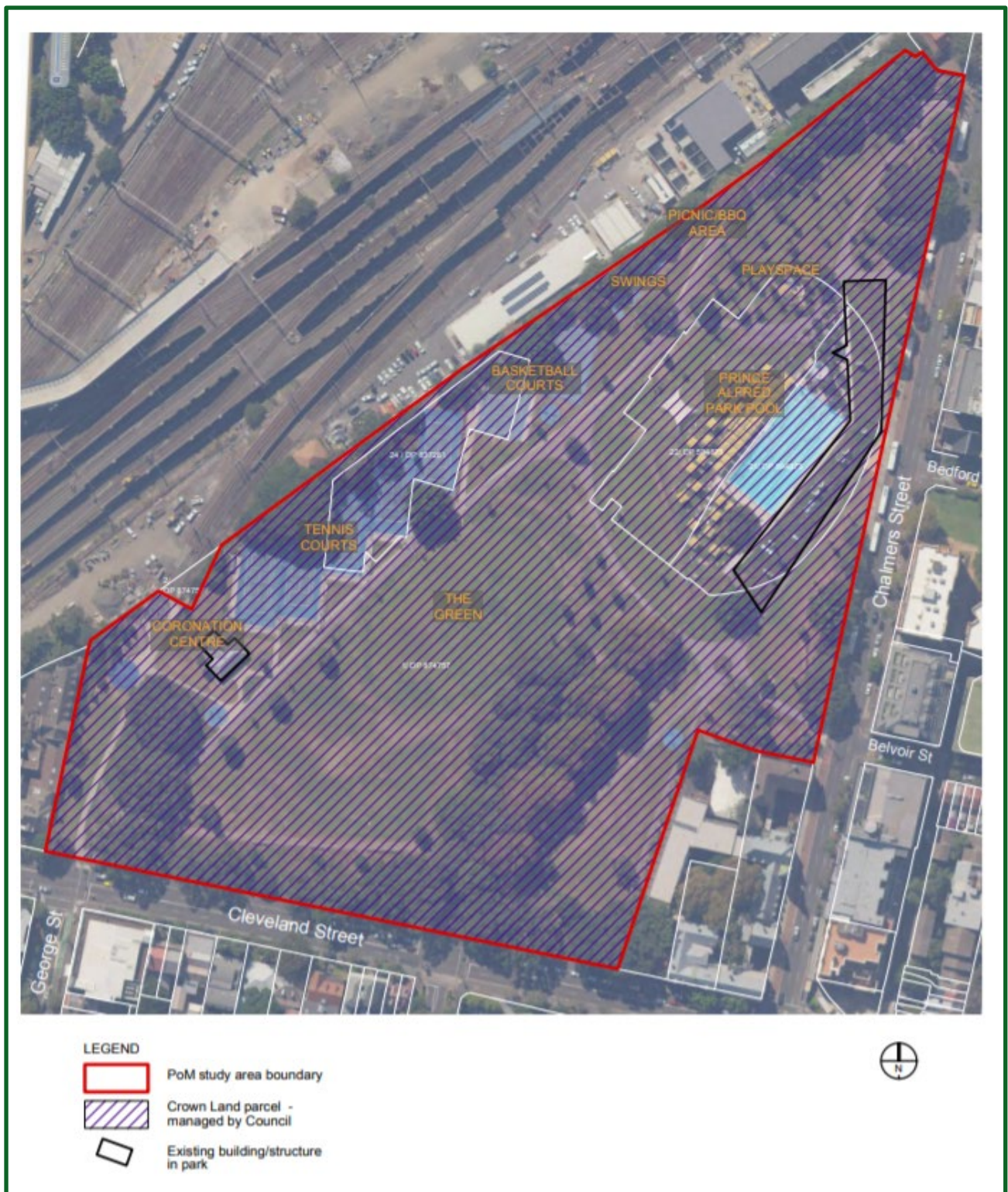
Figure 2. Site Plan