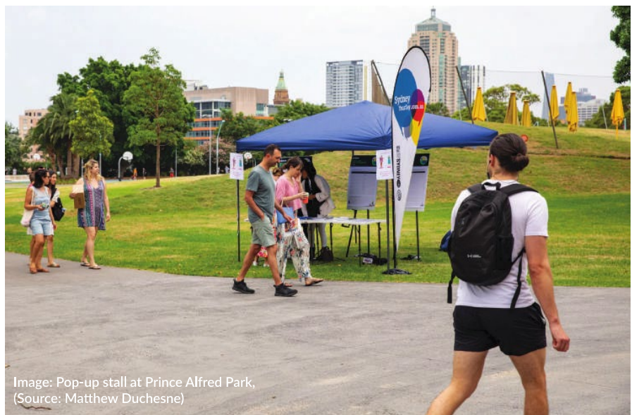
Image: Pop-up stall at Prince Alfred Park, (Source: Matthew Duchesne)