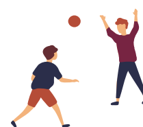
Table 7 - What are the main activities you do here?