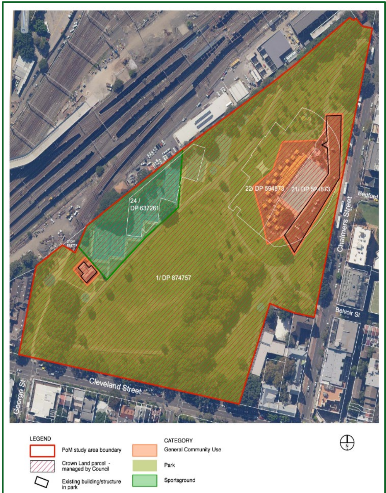
Figure 3. Community land categorisation map