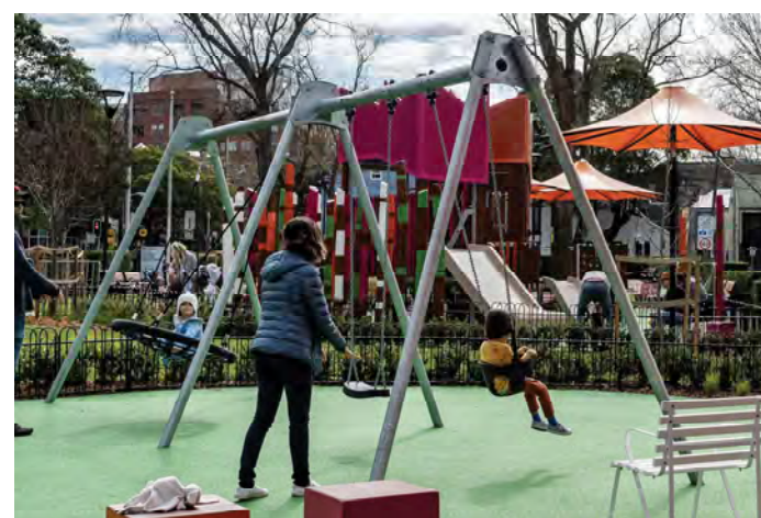
Example of double swing set with seating