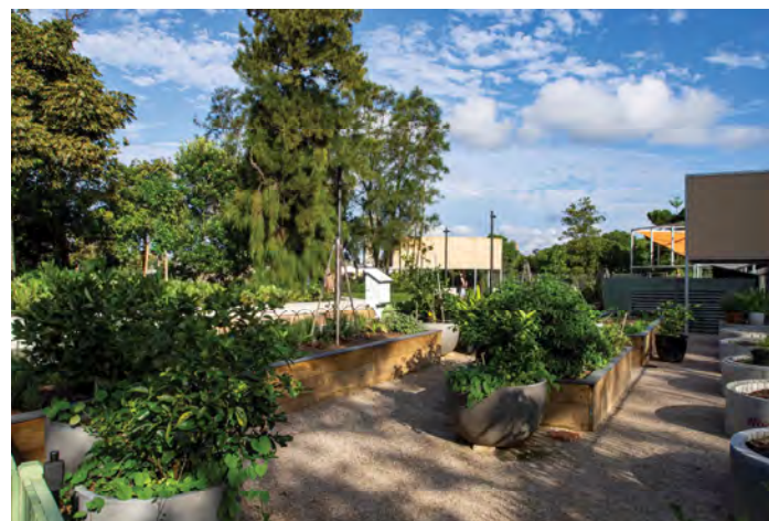
Example of raised community garden beds