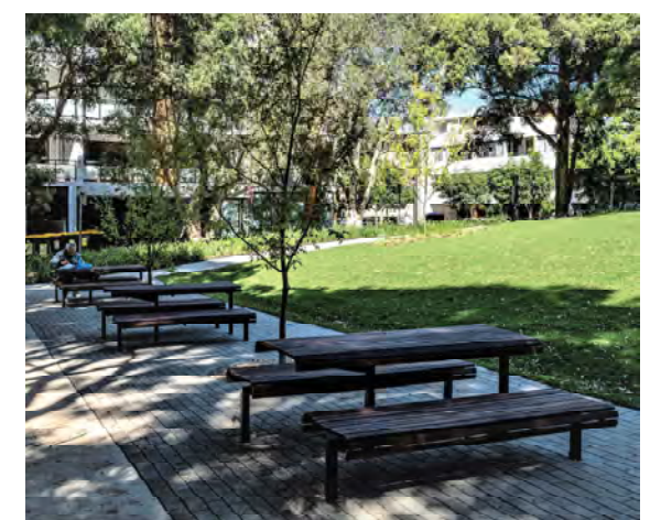
Example of picnic setting and open lawn