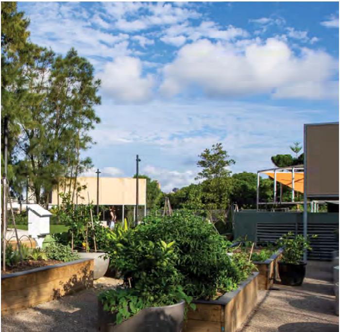
raised rectangular planters