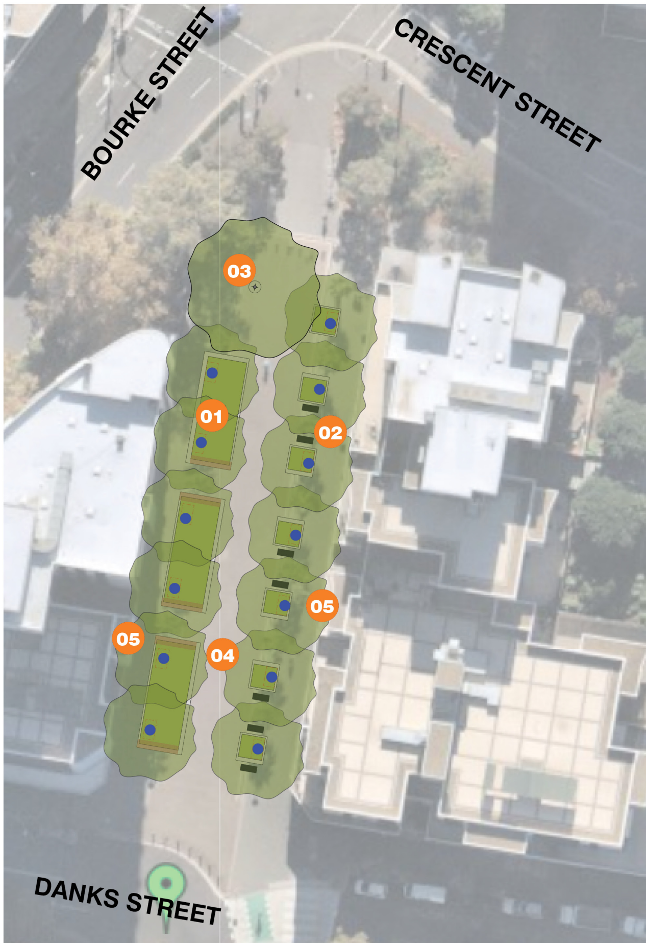
Concept Plan - Not to scale