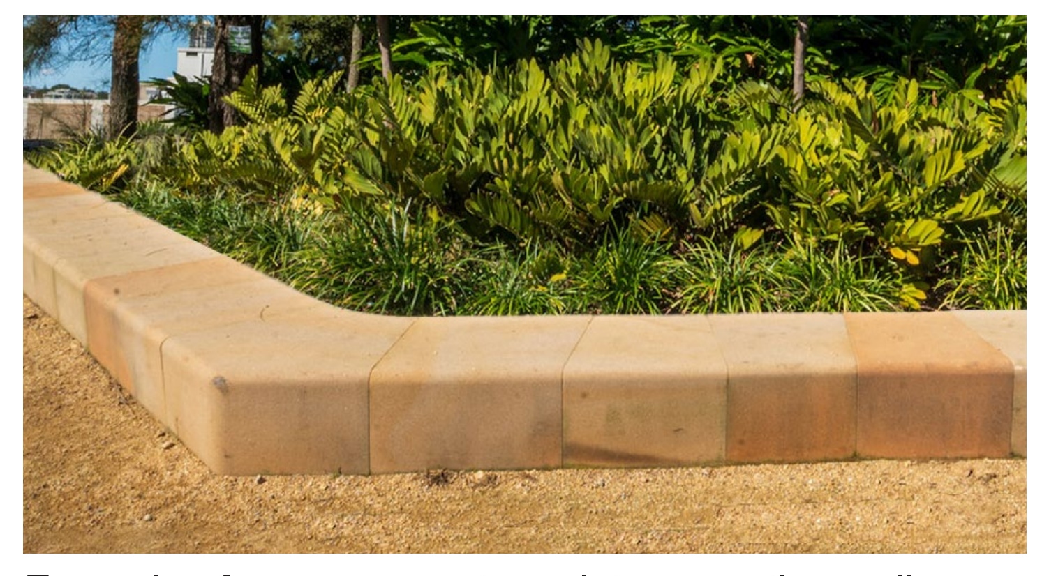
Example of new sawn cut sandstone seating wall