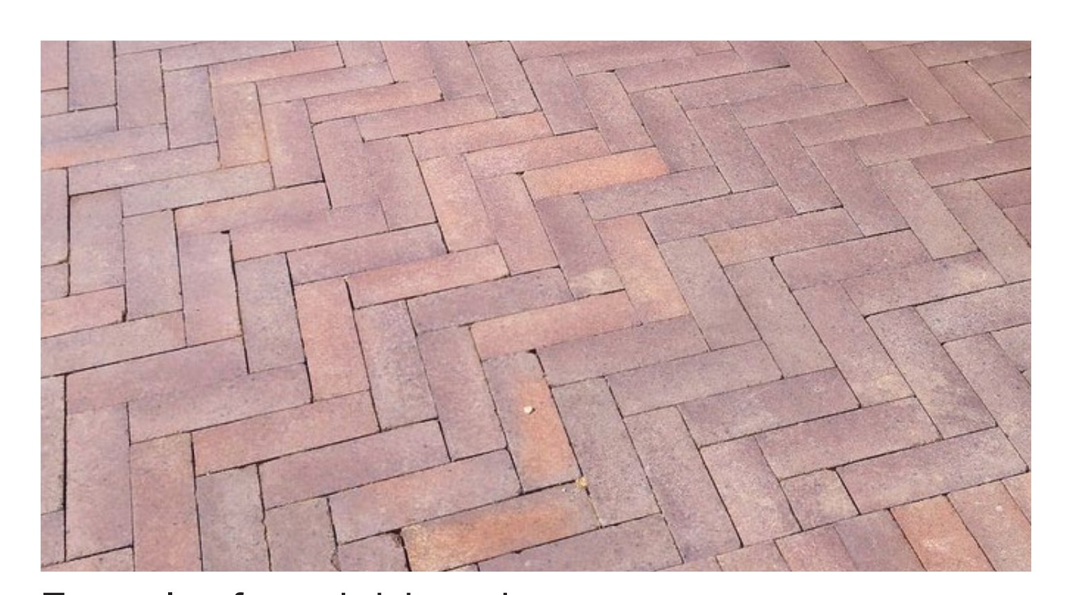
Example of new brick paving