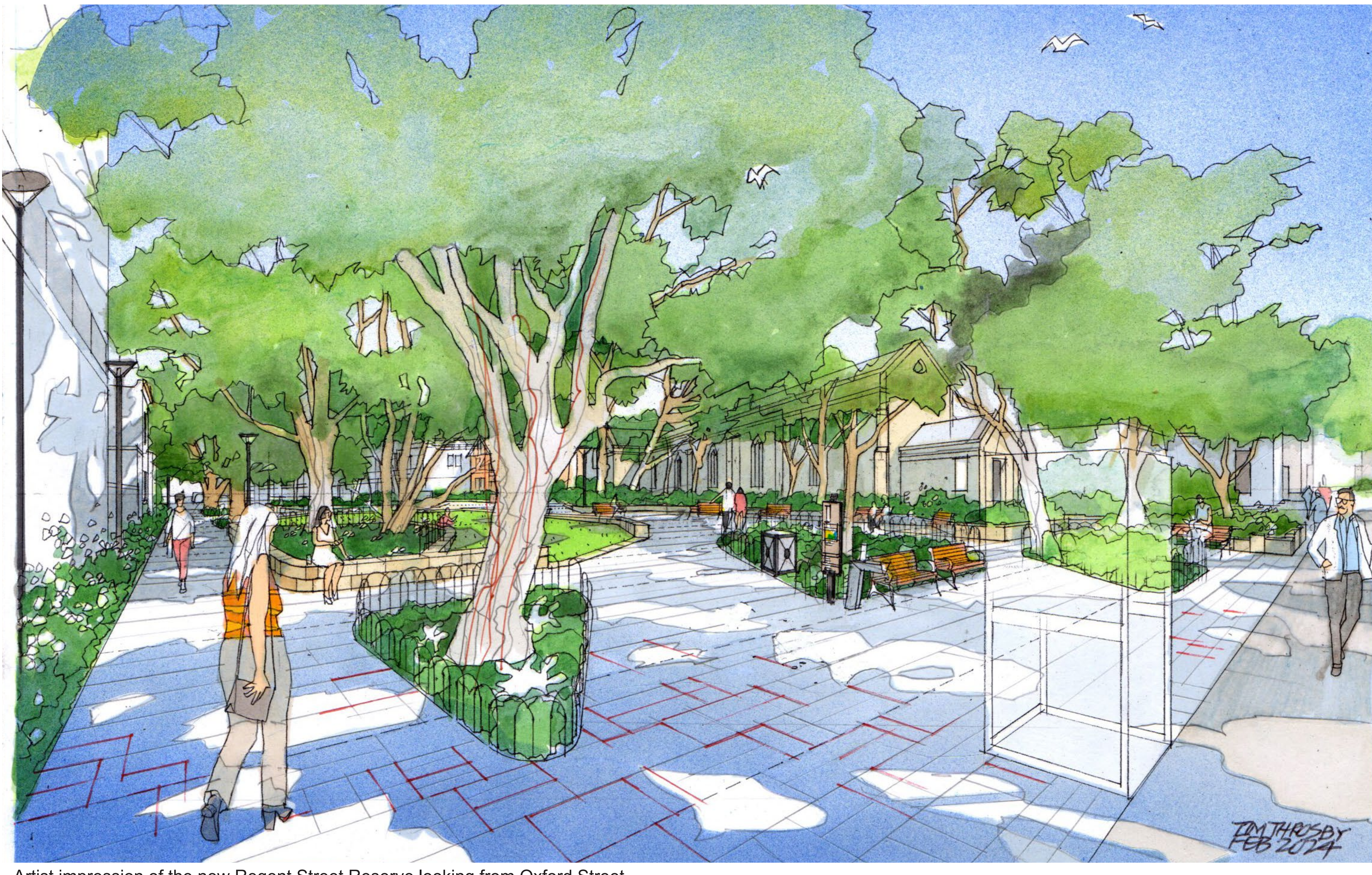
Artist impression of the new Regent Street Reserve looking from Oxford Street

We invite your feedback on the proposed concept design.