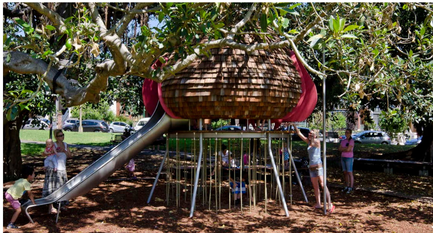
Example of Playground