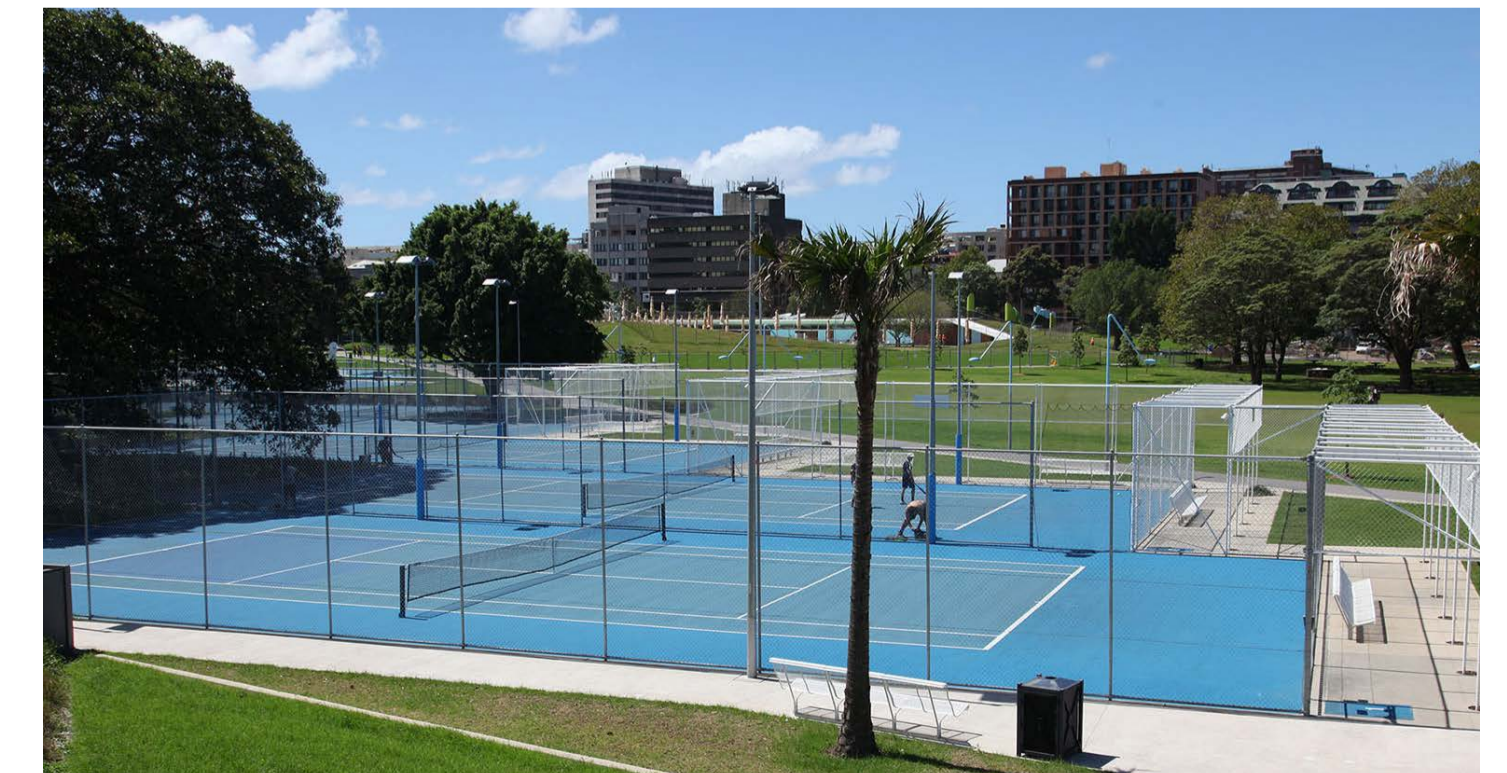
Example of Tennis Courts