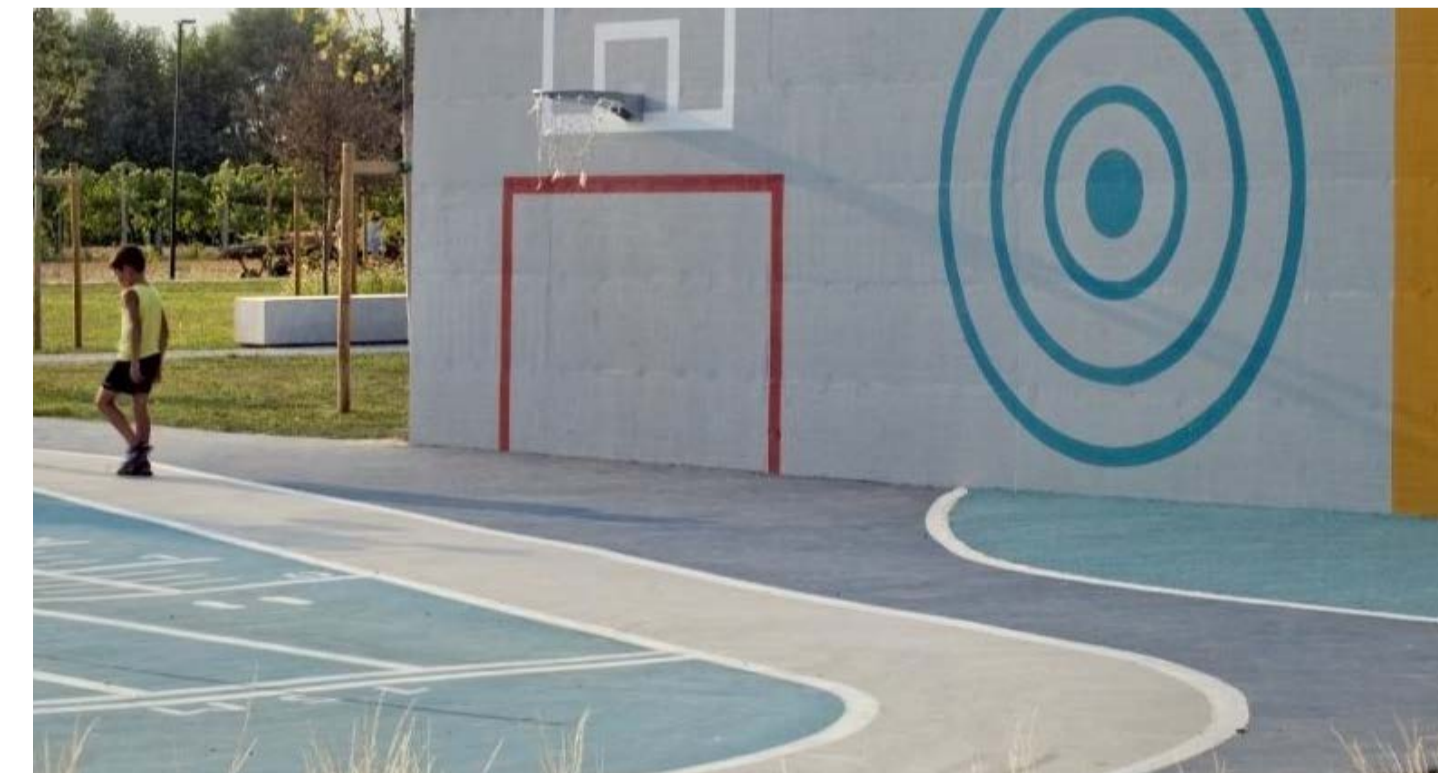
Example of Active Youth Area