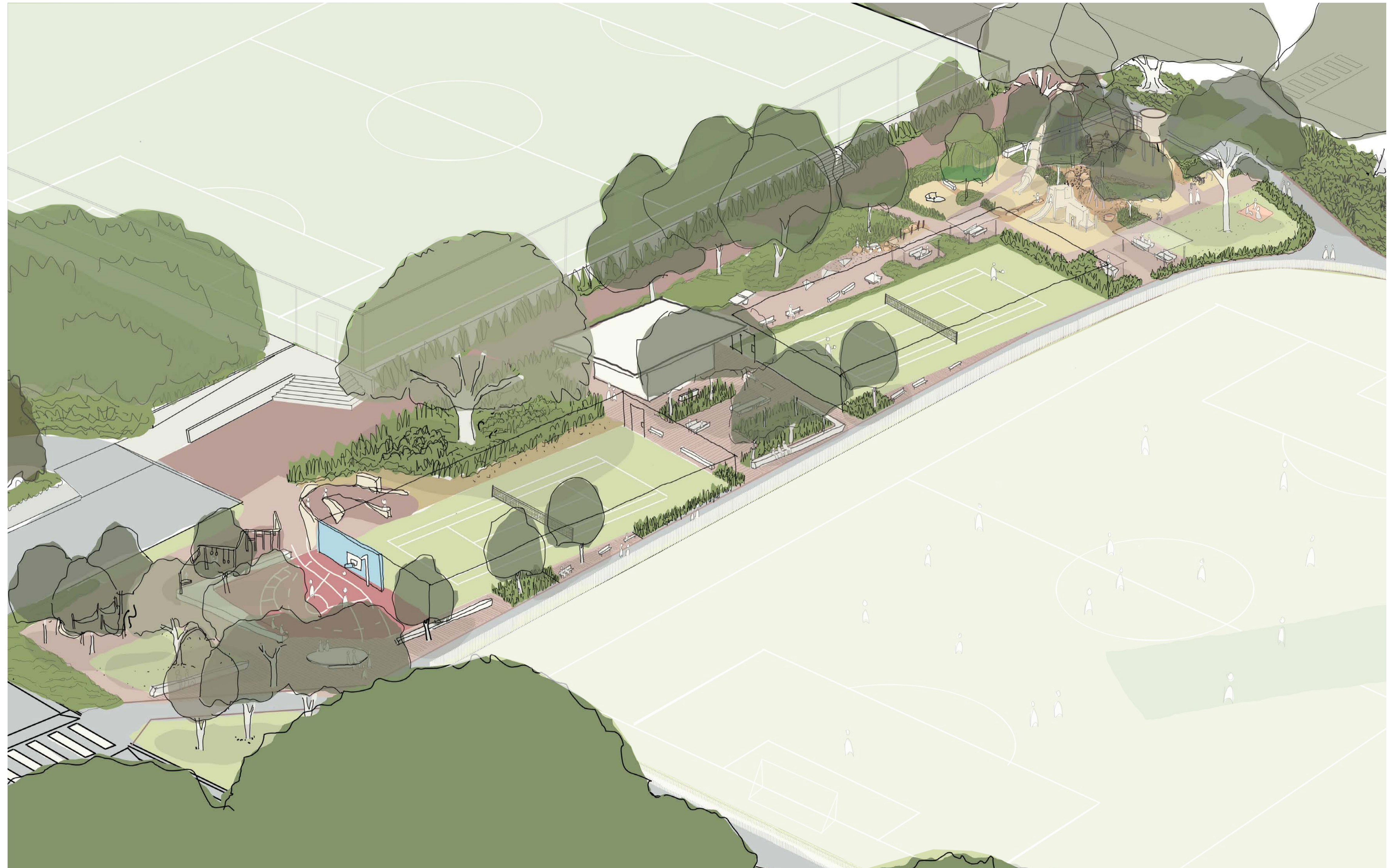
Artist impression of Alexandria Park renewal

The key updates and current design can be seen below. We invite your feedback on the proposed concept design.