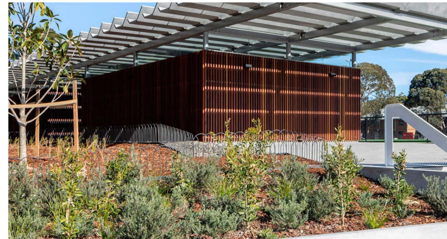
Example of Tennis Amenity Block