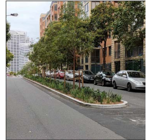
EXAMPLE OF LANDSCAPE MEDIAN STRIP WITH TREE PLANTING