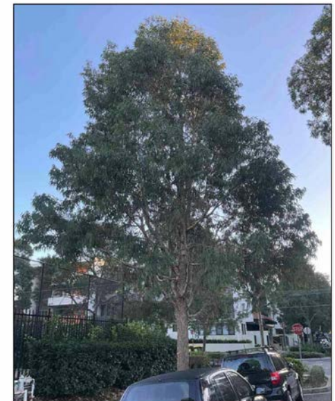
EXAMPLE OF A MATURE YELLOW BLOODWOOD (CORYMBIA EXIMIA) TO BE PLANTED IN LANDSCAPED MEDIAN STRIPS

DRAWING COLOUR CODED - PRINT ALL COPIES IN COLOUR