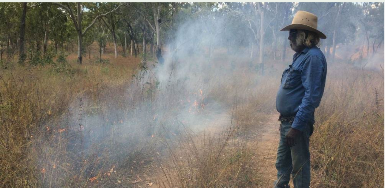
Image: An Elder from Western Yalanji supervising a traditional burn in 2020

The Aboriginal Carbon Foundation is now developing a carbon farming demonstration project on Aboriginal land in NSW. This project received funding by the Carbon Neutral Cities Alliance due to its significant potential to reduce emissions and provide economic development in our region.