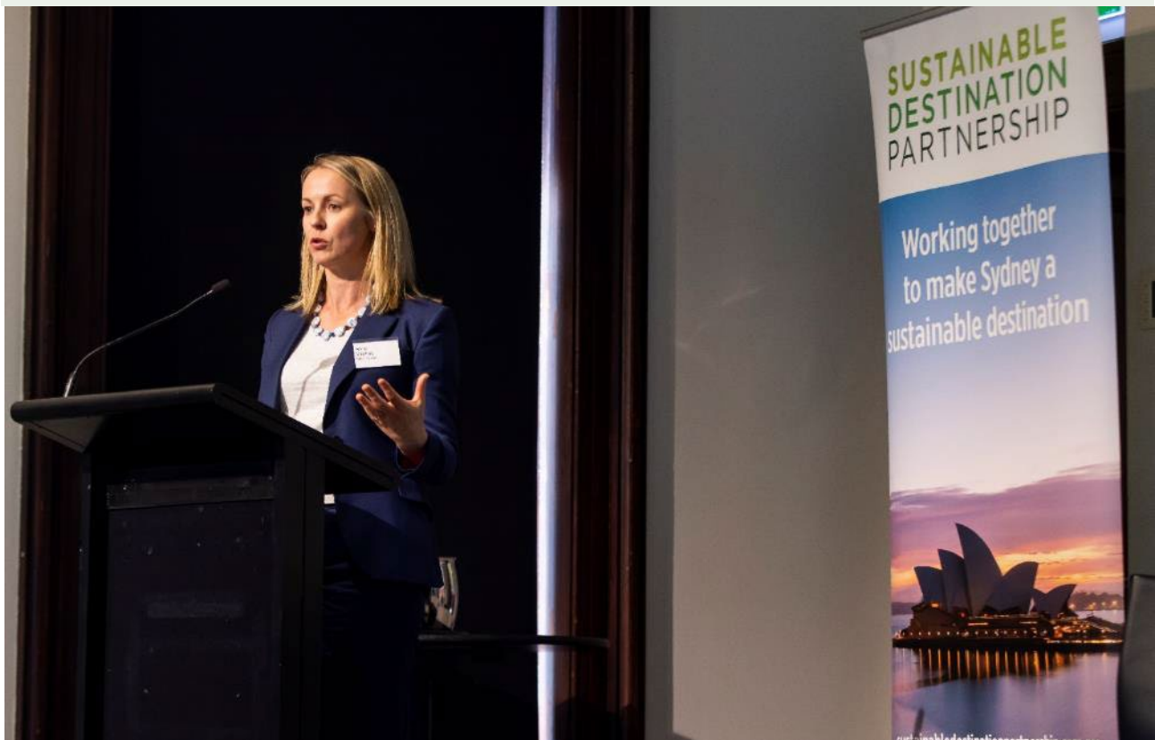
Image: Sustainable Destination event at the Barnet Long Room, Customs House

During the pandemic, the partnership members continued to improve their sustainability performance through improving energy and water-efficiency, minimising waste, and increasing sustainable procurement. These measures will provide strong long-term economic benefits through cost saving as well as attracting more eco-conscious tourists to our city.