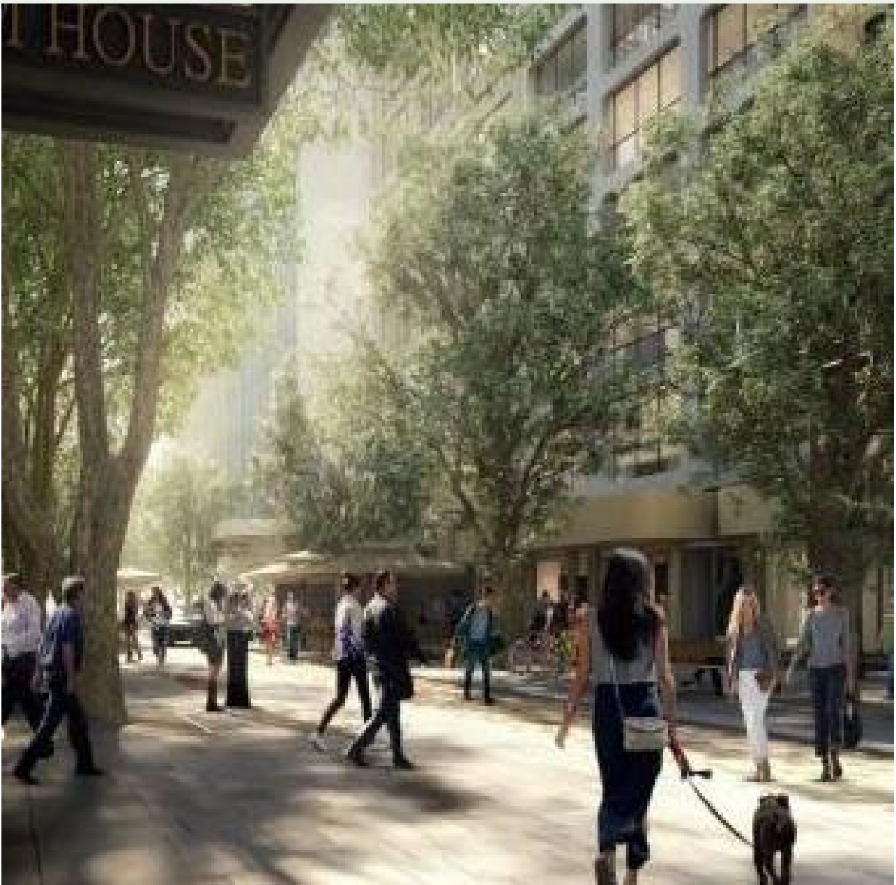
Image: Pitt Street. transformation artist's impression

We are working with Transport for NSW to prioritise people over cars, and the widening of Pitt Street between Hay Street and Eddy Avenue.