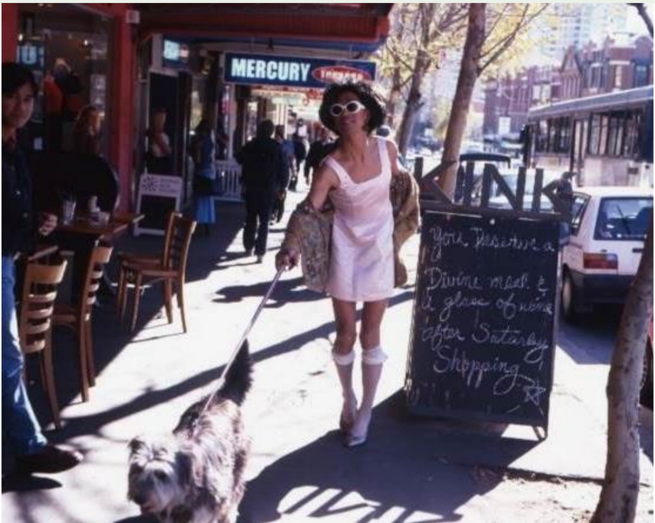
Image: Dog walker on Oxford Street circa 1988

Visibility is vital to create a proud, colourful, and welcoming destination that Oxford Street is known for globally. We will also continue to address disadvantage and connect people with the services they need.