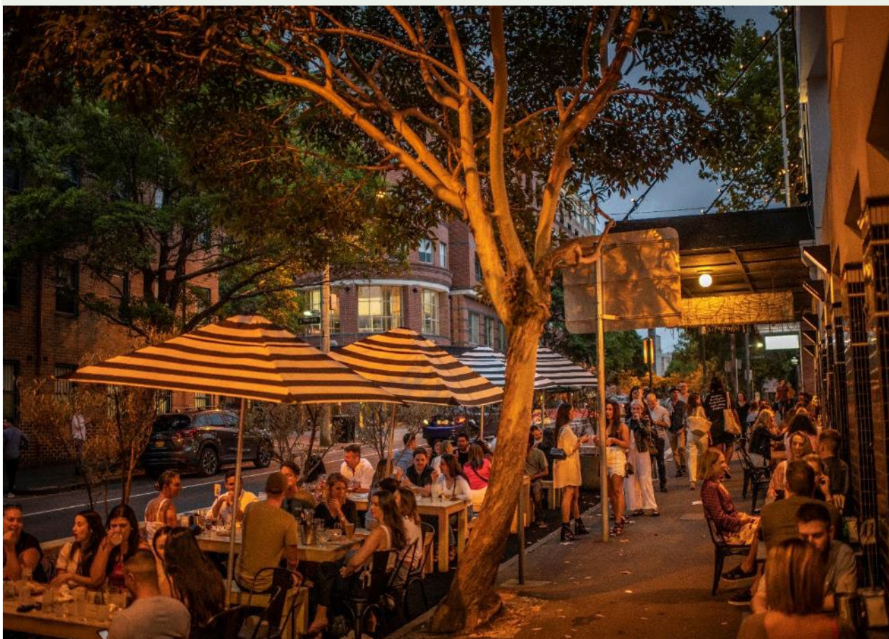
Image: Outdoor dining at the Dolphin Hotel, Surry Hills

Hospitality businesses who have taken up this opportunity have enjoyed growth of customers, turnover, staffing and outdoor dining space, which has benefited their businesses, the economy, and the vibrancy of the local area.