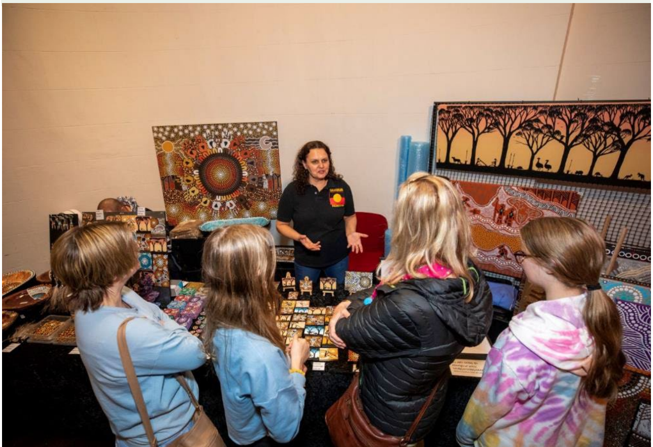
Image: NAIDOC in City 2022, Sydney Town Hall

Community wealth building principles are seen here building the generative economy through supporting social enterprises.