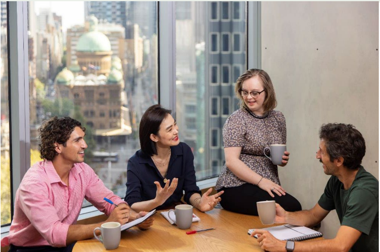
Image: City of Sydney staff enjoying workplace collaboration

Following our involvement in the network, we were awarded Disability Confident Recruiter status. This involved a comprehensive assessment of our recruitment systems and commitment to remove unintended barriers for candidates with a disability. Additionally, we implemented a version of the Australian Public Service's Recruitability scheme. Now, applicants who identify as living with disability, and meet the requirements of a position, will automatically go through to the interview stage. We continue mandatory Disability Awareness training for all.