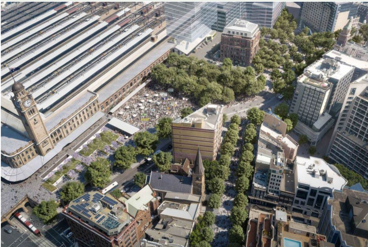
Image: Concept design for central square

Collaboration between universities and industry will maximise the commercial potential of research and development projects. This'll attract talent and investment and in turn accelerate the precinct's productivity.