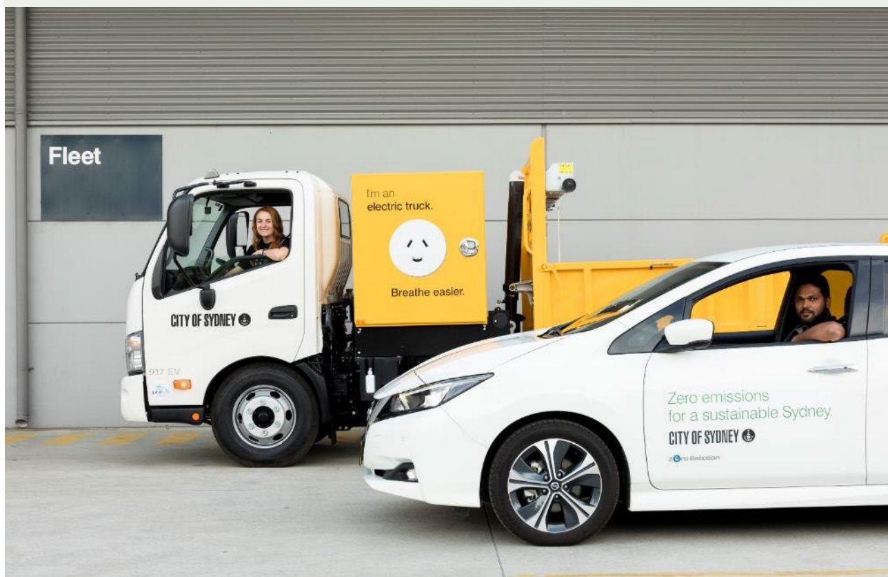
Image: City of Sydney staff with the fleet's first electric truck and car

We're aiming for zero fleet emissions by 2035. Currently we have 19 electric cars, 40 hybrid cars, 70 hybrid trucks and one fully electric truck.