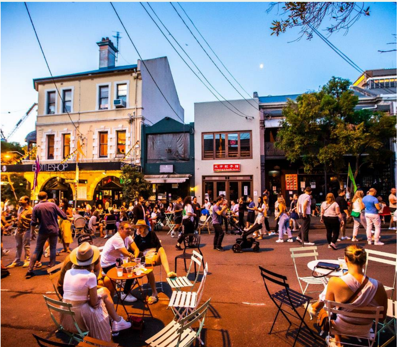
Image: Summer Streets 2022, Stanley Street, Darlinghurst

We will continue this program three times per year, across seven main streets to drive vibrancy and support for our local city centres.