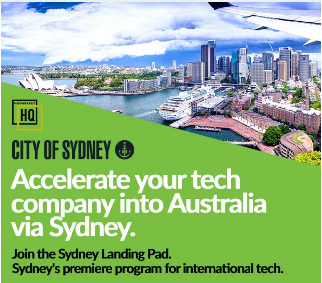
Image: Promotional image for the Sydney Landing Pad

We are now in discussion with industry partners to explore the opportunity to launch the second iteration of the Sydney Landing Pad Program.