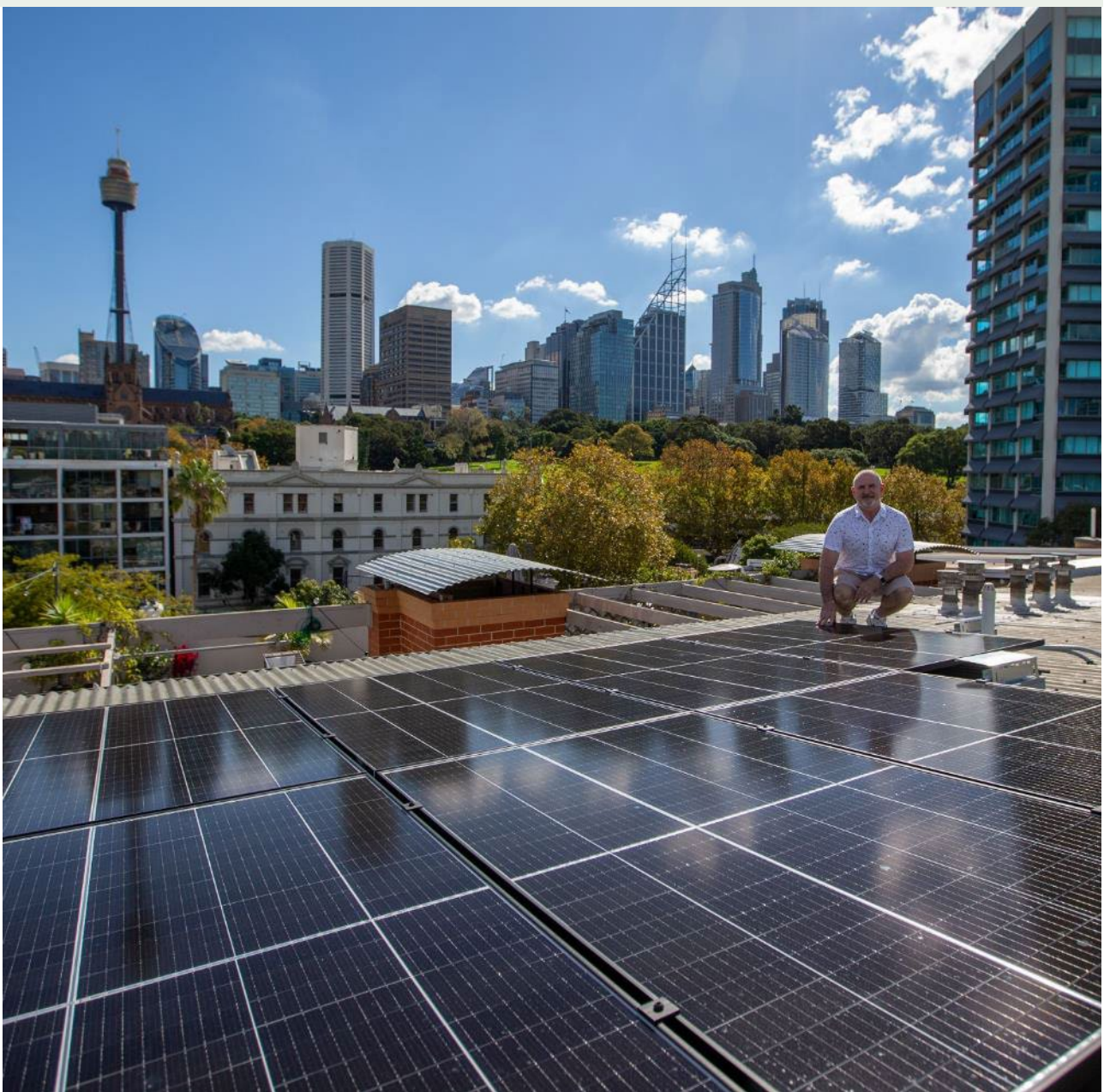
Image: Smart Green Apartments Program, Solar panels at the Galleria 27-51 Palmer Street, Woolloomooloo

To encourage businesses to take the move, we started promoting our own power purchase agreement. We also developed a range of resources to educate businesses about offsite renewable electricity options, including Power Purchase Agreements and GreenPower.