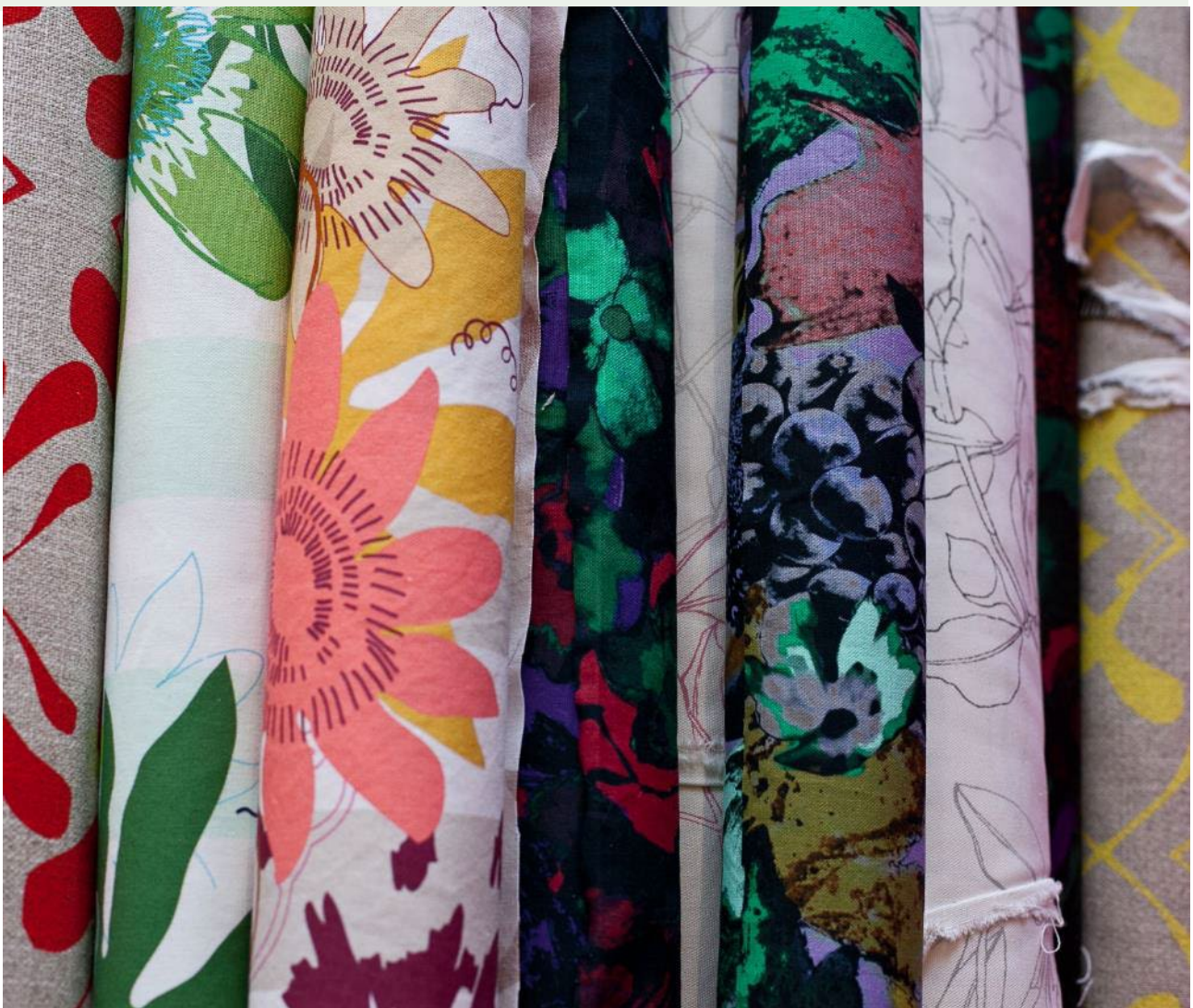
Image: Colourful textiles on display

The project showcased a true example of a circular economy model by turning textile waste into a resource. It demonstrated the commercial value of the circular approach that'll encourage stronger and wider collaborations across industries.