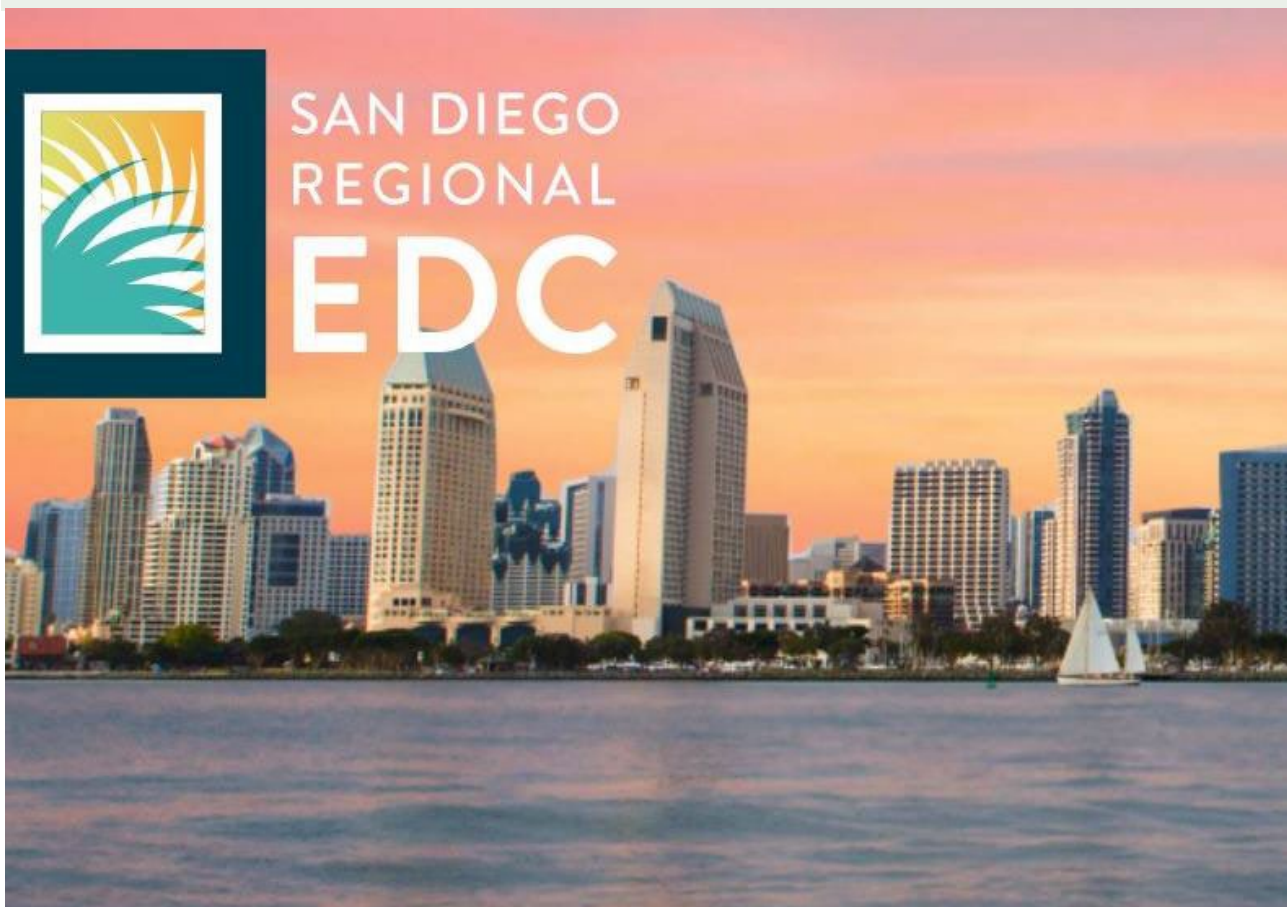
Image: San Diego Regional Economic Development Collaboration, hosting the San Diego anchor institution collaborative