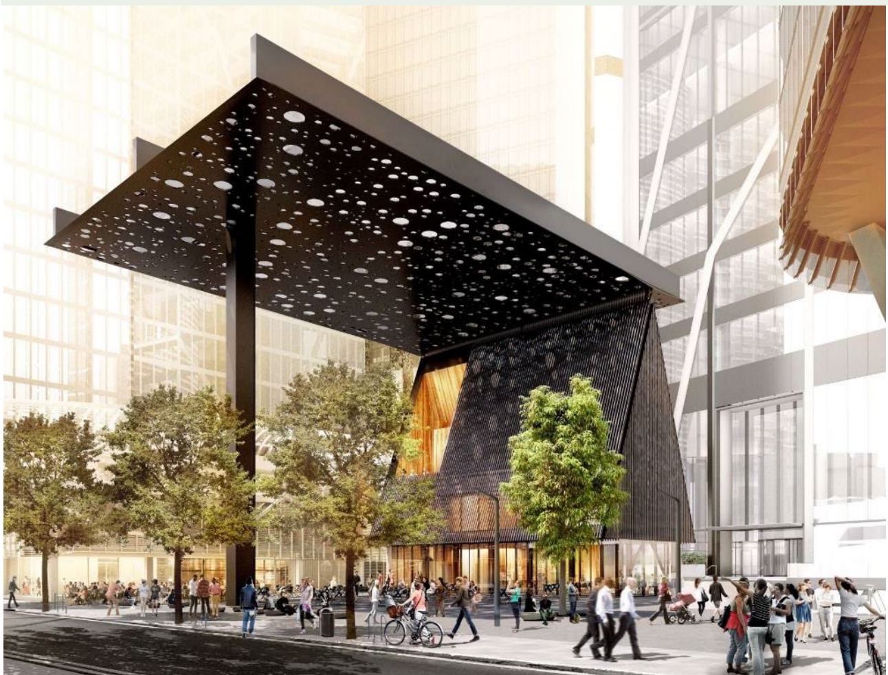
Image: Sir David Adjaye and Daniel Boyd design for new public square, building and artwork, 180 George Street, Circular Quay

Greenhouse will support emerging technology companies with investment capital, talent and growth services to realise their global ambitions. This will accelerate Sydney's climate-tech scaleups' expansion into global markets and position Sydney as the home of smart, inclusive, and green innovation.