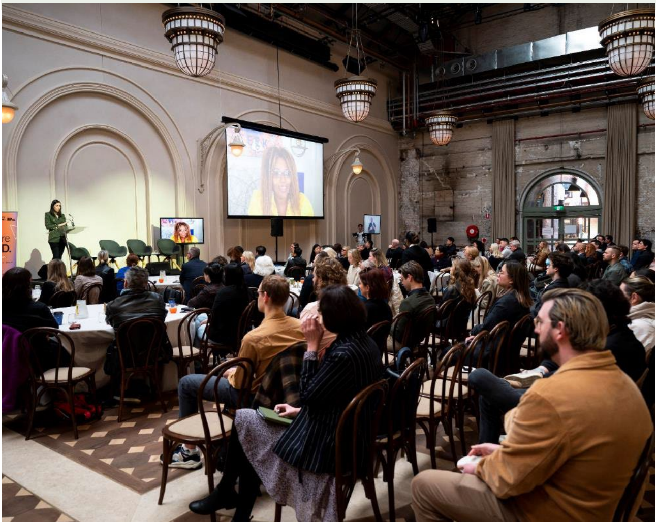
Image: Visiting Entrepreneur Program 2022, The Grounds, South Eveleigh

Partnering with over 90 organisations, including Sydney Startup Hub, StartupAus, Spark Festival, USYD, UNSW, UTS, and Cicada Innovation, it's delivered 74 events for over 6,500 members of the local tech startup ecosystem.