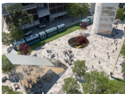
The future Green Square Library and Plaza

The City's carefully managed, strong financial position at the end of 2012/13 means we are able to make record investments in infrastructure over the next ten years.