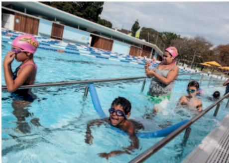
The new Prince Alfred Park pool