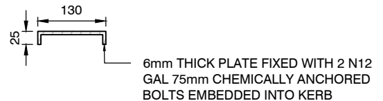
GALVANISED PLATE DETAIL 1:10