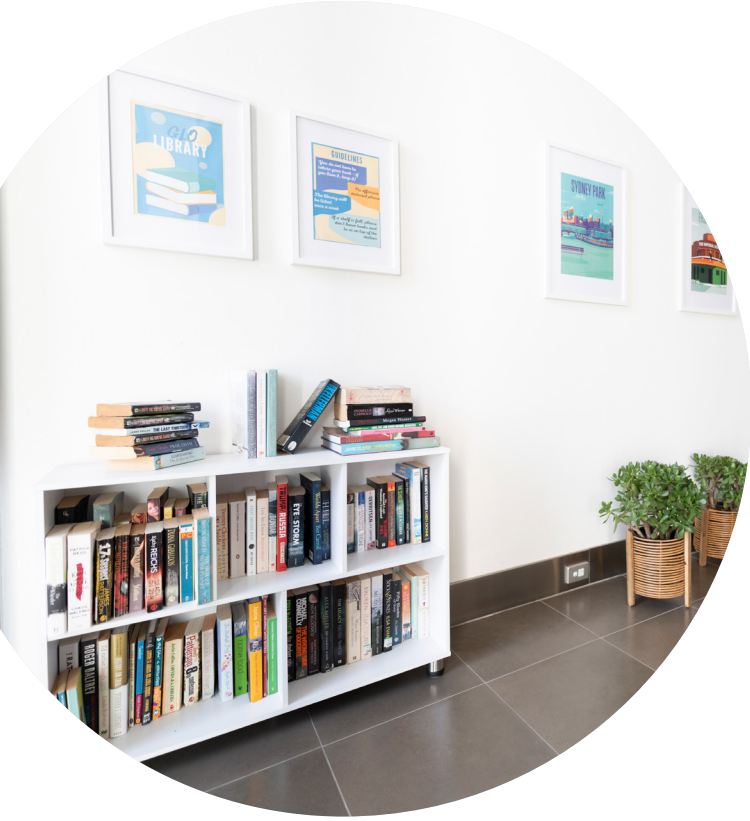
Image: Glo apartments foyer

Go above and beyond with these great initiatives