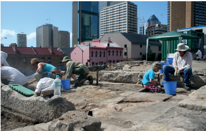
The Cumberland / Gloucester Streets Archaeological Site, 2008

Directly opposite Susannah Place is the site of an archaeological excavation which started in 1994 and came to be known as the “Big Dig”. It revealed the foundations of over 40 houses, shops and hotels, all crammed onto this small site. Some of the excavated remains are exposed and able to be viewed from the Sydney Harbour YHA. You can learn more about the people who lived here at The Big Dig Archaeology Education Centre.