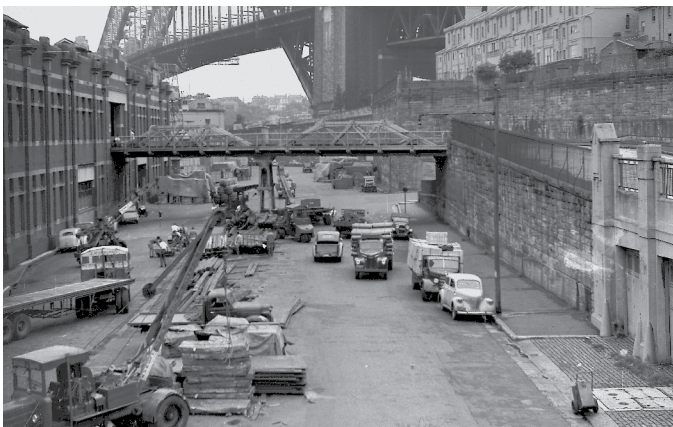
Hickson Road, 1952.

These huge two-storey timber wharves were part of a massive reconstruction by the Sydney Harbour Trust, set up by the government in 1901 to modernise Sydney's chaotic and inefficient waterfront. The wharves were intended to be built using concrete, but due to shortages of materials after World War I, timber was used. The wharves and their associated shore sheds form a rare group of industrial structures, built over a number of years from 1910. New shipping technology in the 1970s rendered them redundant. But the finger wharves were gradually refurbished and repurposed, achieving a high standard in adaptive re-use. Today, the wharves house a vibrant residential, restaurant and cultural hub.