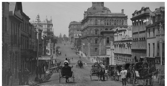
View along Bridge Street in the 1890s

Bridge Street was named in 1810 for the wooden footbridge crossing the Tank Stream, the colony's first water supply. From the start, the town was both physically and socially divided by the Tank Stream. On the eastern side were the Governor's house and the tents of the civil establishment. To the west were the makeshift barracks of the military and the convicts. Many signs of this social division remain today. Along the high eastern section of Bridge Street, you will notice several impressive early government buildings, including the Lands Department, the Education Department and the Chief Secretary's Building. The western end is more commercial, heading towards the once-raffish Rocks.