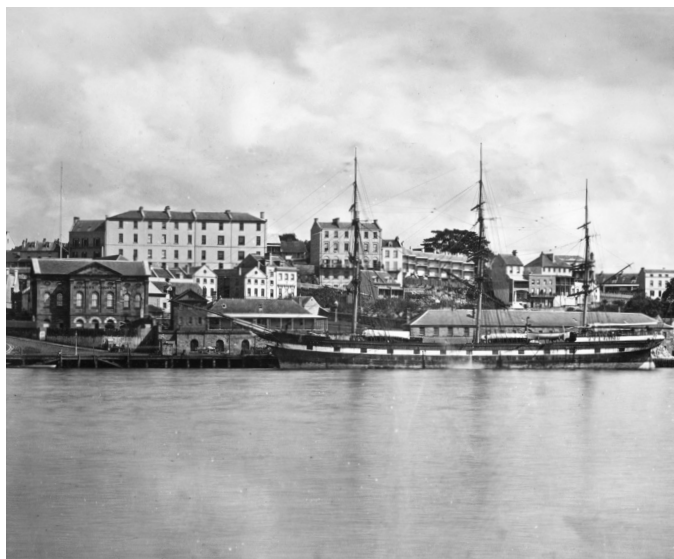
The Rocks viewed from the eastern side of Circular Quay, 1880s

The higgledy-piggledy streets and narrow laneways which still define The Rocks record the first places the convicts and ex-convicts made their own. The vision of the convicts living in barracks weighed down by ball-and-chain is overstated. Many more convicts simply worked for the government during the day and worked for themselves the rest of the time, building houses, opening shops, running pubs and creating a new life. Today The Rocks is a living museum and practically every place has a story to tell.