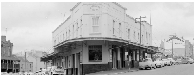
The Australian Hotel, 1960.

This is a typical early 20th century hotel, built in 1914. It retains its original pressed metal ceilings and etched glass fittings. The split level bar follows the rugged lie of the land. The odd shape of the land is a result of street re-alignments for the building of the Sydney Harbour Bridge.