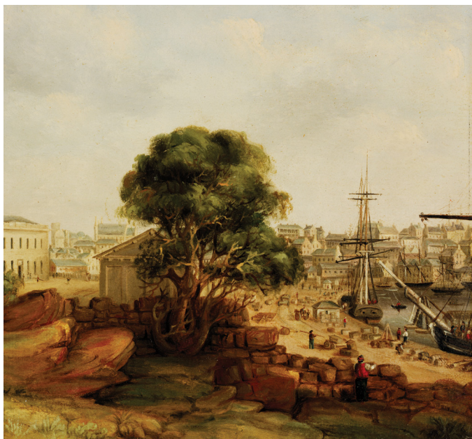
From George Peacock's 1845 Custom House & part of Circular Wharf

Please note that there are steep inclines and stairs along the way. Start at Customs House (1).