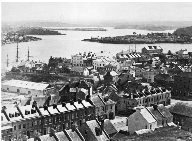
Millers Point 1882