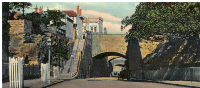
Argyle Cut c.1908

The Argyle Cut is a striking example of convict public works. It was a colonial effort to overcome a challenging landscape, providing a more level crossing between The Rocks and Millers Point. In 1843, convict labour was deployed to cut the roadway through the rocky peninsula. It was completed in 1859 with the use of explosives and council labour. Bridges over the cut were completed later. The Argyle Cut was altered again in the 1920s with the construction of the approaches to the Sydney Harbour Bridge.