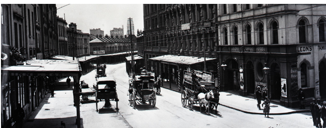
Looking north along George Street from the corner of Grosvenor Street, ca.1900.