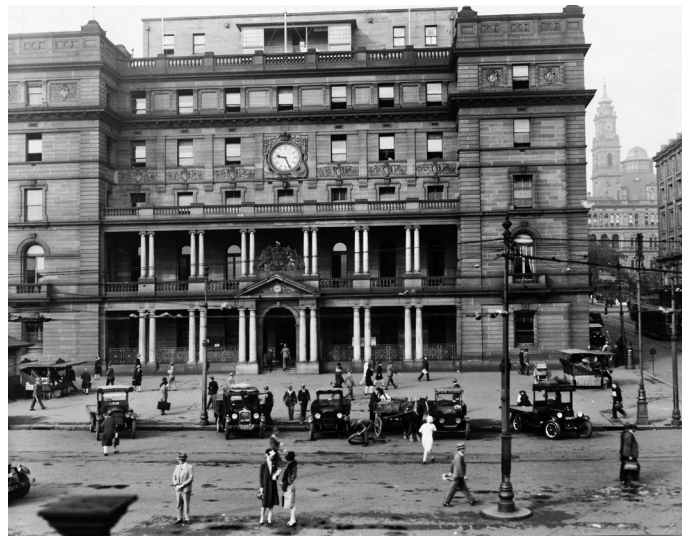
Customs House in 1928

Customs House was where shipping was cleared and goods passing through the port of Sydney were taxed for sale or export. When the port was busy the House was crowded and noisy, a scene of raised tempers, delays and disputed dealings. The six-storey colonnaded building you see today evolved through several phases of expansion between 1845 and 1917. On Loftus Street alongside the House, a Union Jack flies permanently on the site where the first British flag was raised. For some Australians, this is the site of invasion. Look up to see the Aboriginal flag flying from the roof of Customs House.