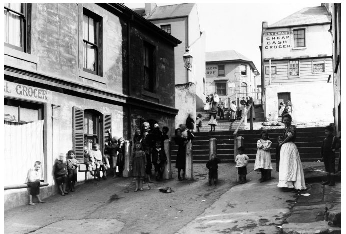
Cumberland Place in 1901

Early maps show a lane on the alignment of the Cumberland Place steps as early as 1807. They lead into Gloucester Street. You are now in a network of streets and laneways that form the heartland of old residential Sydney.