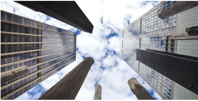
Edge of the Trees installation, Museum of Sydney forecourt