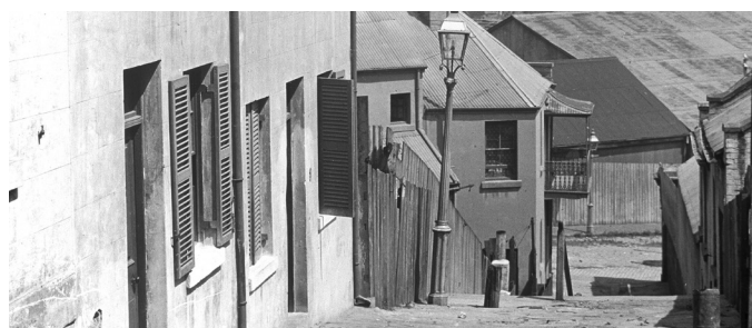
Ferry Lane 1936

This flagstone laneway once led to the waterfront. The history of the area is told in the plaques and signs in the lane and in the reserve below, called The Paddock.