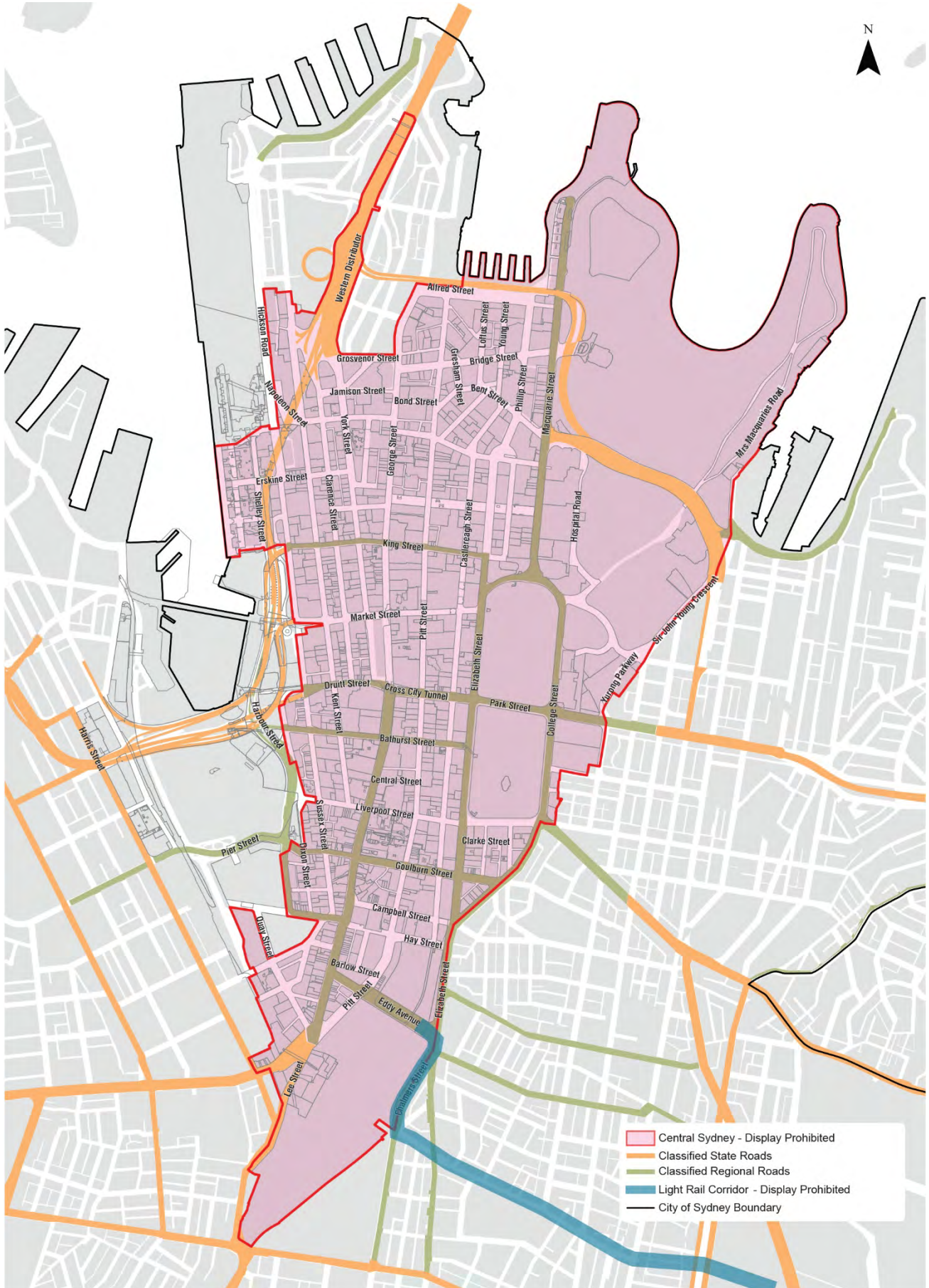
Figure 2 – Central Sydney