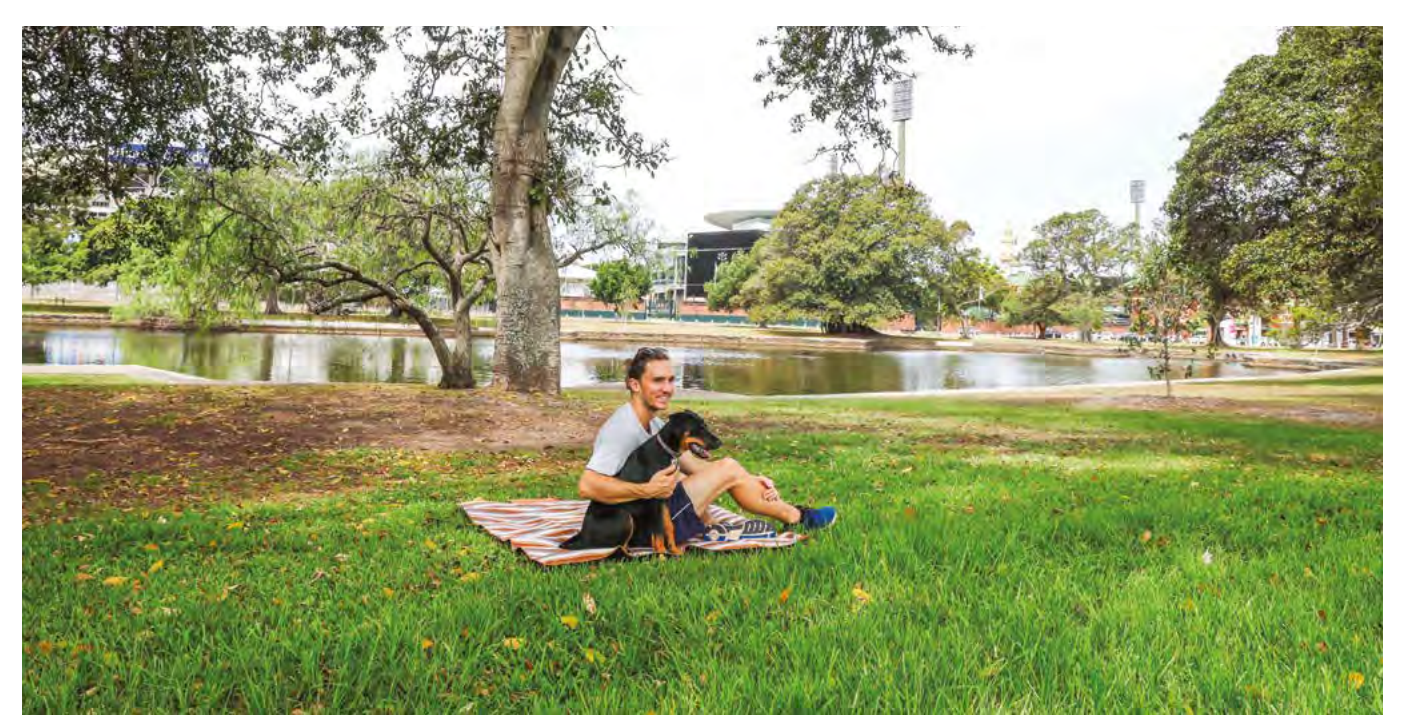
Time out in Moore Park.