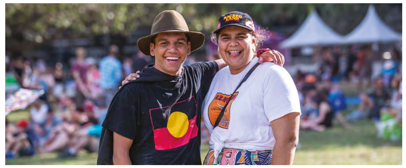
Yabun Festival celebrates Aboriginal and Torres Strait Islander cultures in Australia.