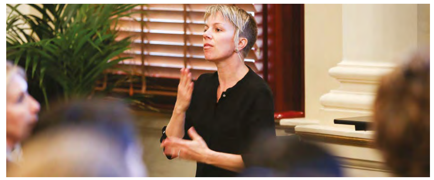
A woman speaks in Auslan to a group.