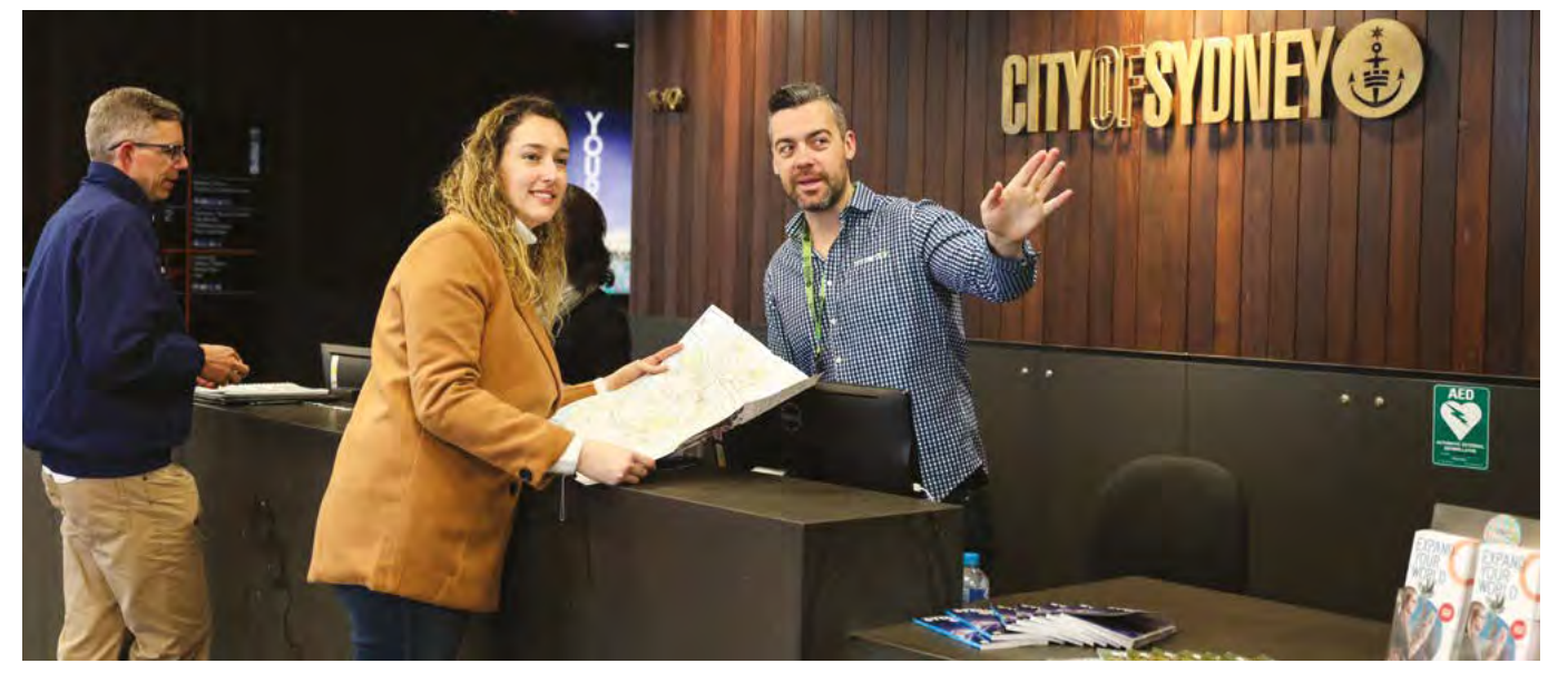
City of Sydney customer service centres provide many services to the community.