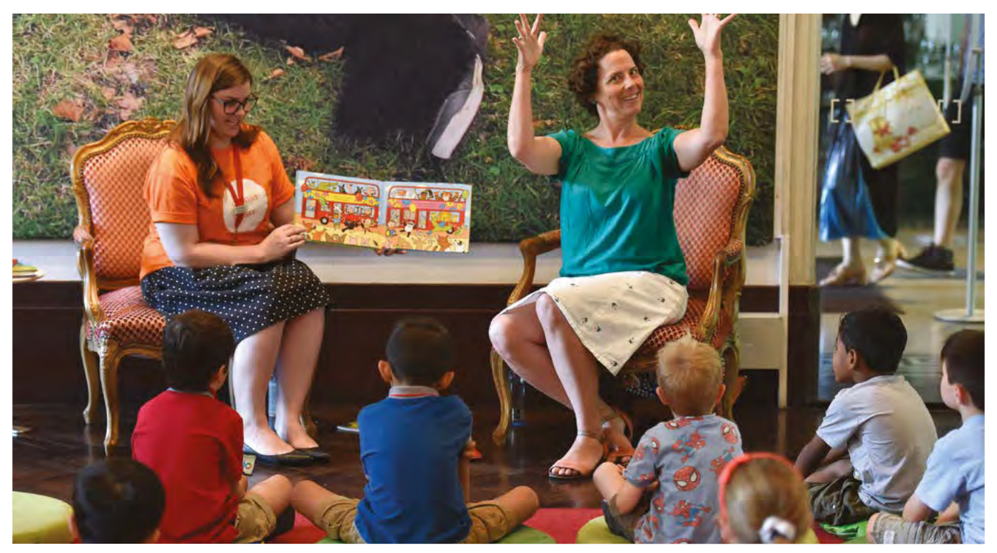
Auslan Storytime for pre-school age children.