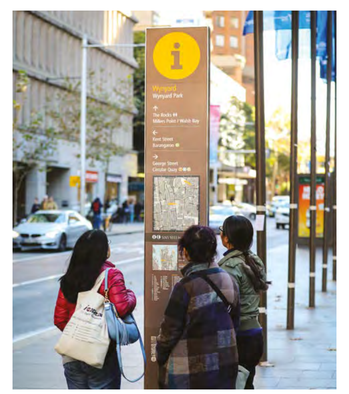
Wayfinding map at Wynyard.

Other issues raised included: improved access to lifts particularly in areas where there are barriers such as steps or challenging topography, more seating for people who cannot walk long distances to rest and accessible public toilets, including a need for more adult change facilities in key locations.