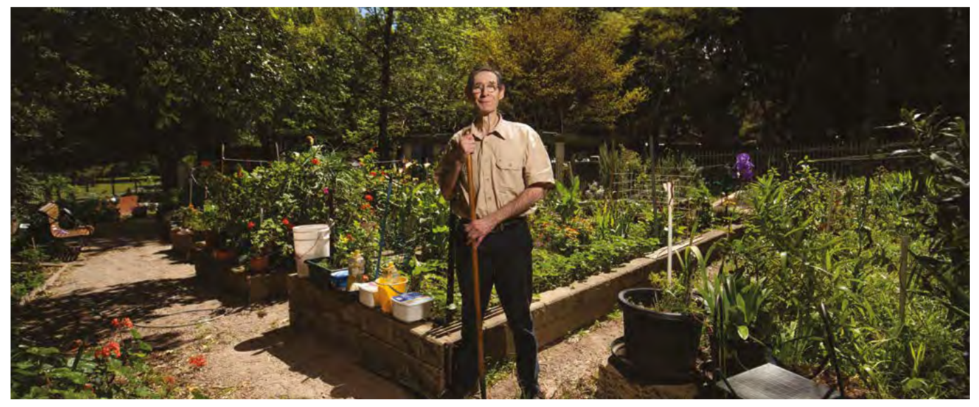
Waterloo Estate Community Garden promotes health and wellbeing.

One in five (20 per cent) or 4.8 million Australians and nearly 1.5 million NSW residents (19 per cent) had a current and long-term mental health condition in 2017–18, nearly double the rate recorded in 2007–08 (11 per cent).<sup>17</sup> 22 per cent of City of Sydney residents reported 'poor' or 'fair' mental health outcomes in 2018, up from 14 per cent in 2015. The proportion was much higher among people who identified as a person with disability with 52 per cent rating their mental health as 'poor' or 'fair'.<sup>18</sup>