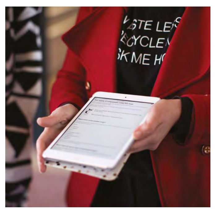
City of Sydney information sessions for communities in various formats.