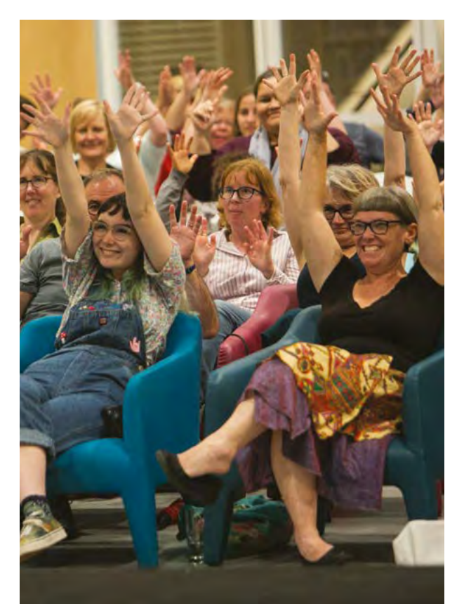
Auslan Poetry Slam audience applauds.

The Deaf community has a shared language and culture and a long tradition of common experience. Members of this community are mostly those people who were born deaf or became deaf early in life. Members may also include hearing friends, family members and those who work with Deaf people, such as interpreters and community workers. What particularly links individuals and groups and makes them a distinct community is their shared use of Auslan (Australian Sign Language).