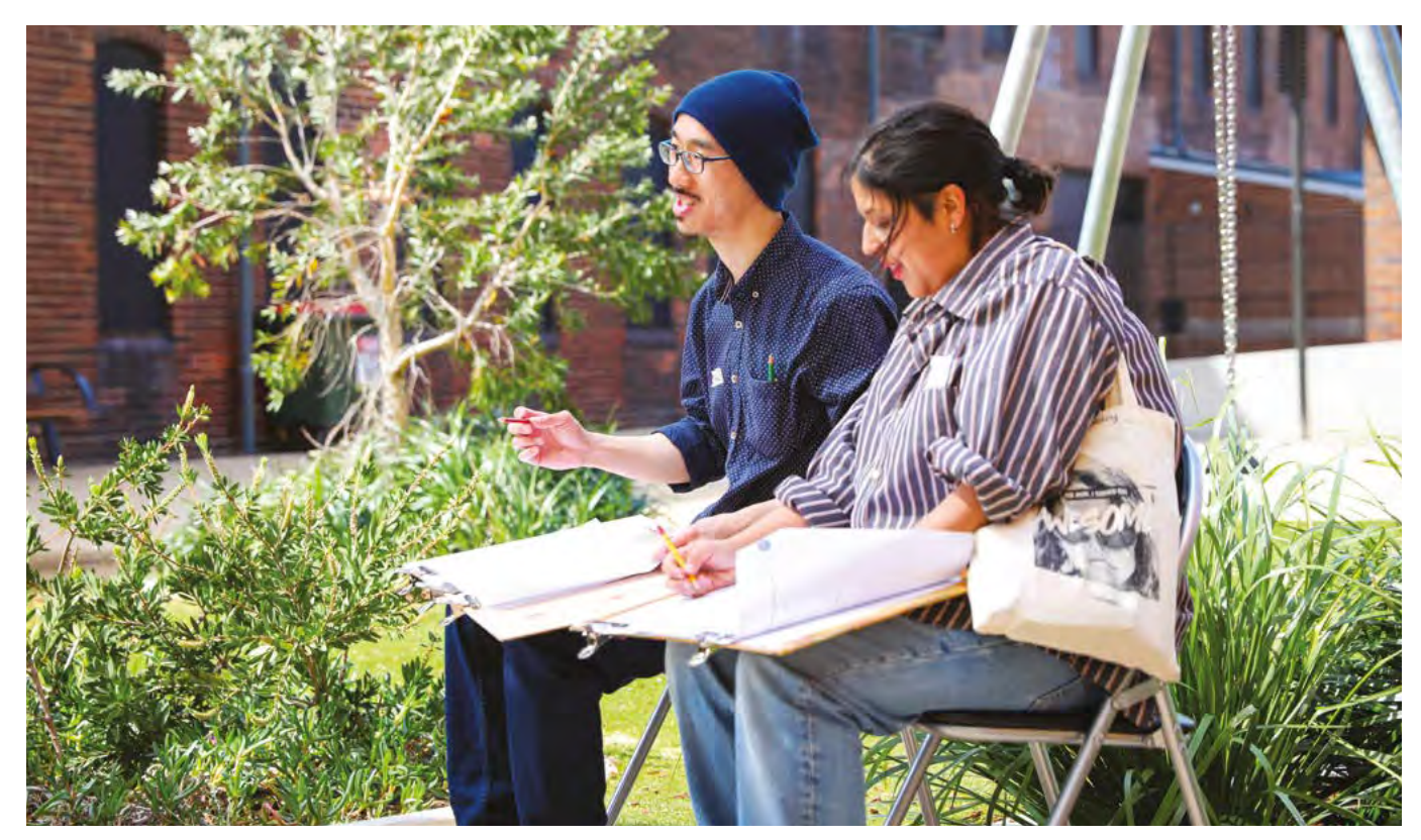
Drawing workshop held in Zetland.

The City of Sydney recognises there is an underlying social responsibility to remove barriers from the mainstream services it provides, the employment opportunities it provides to the community and the infrastructure and public spaces it manages.