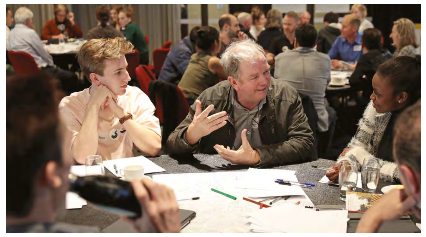
Consultation with people on Sydney 2050.

Four targeted workshops attended by 16 people with Autism and people with intellectual disability, including parent-carers.