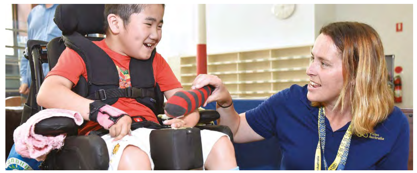
Sensory Feelix Storytime brings stories to life through braille, tactile books, objects and craft for children.