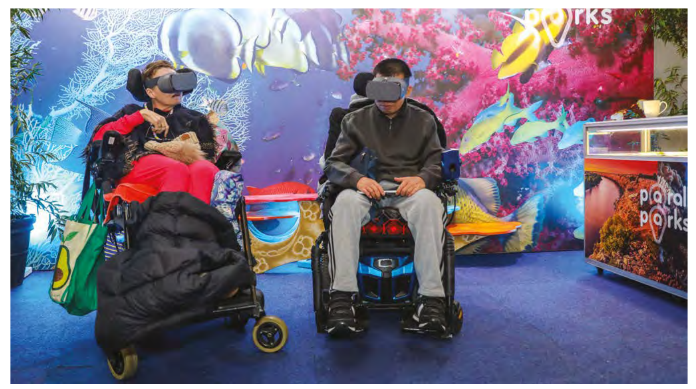
Virtual reality headsets allow people to explore the Great Barrier Reef at Customs House Library.