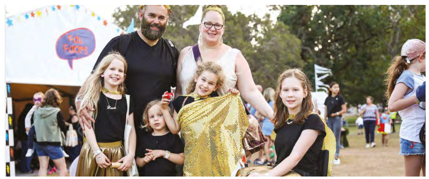
Lord Mayors' Picnic held at the Royal Botanic Garden Sydney on New Year's Eve.