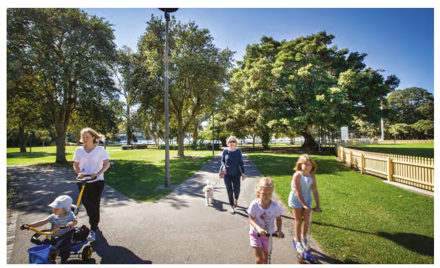
Green, global and connected at Rushcutters Bay Park.

In 2018, Council resolved to review this vision, engaging the community in the development of a revised plan that extends to 2050. We expect our Council will consider the 2050 vision in mid-2021 and this will inform our new community strategic plan in 2022.