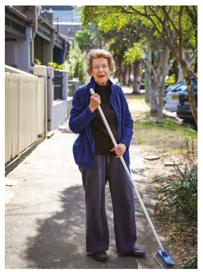
Local residents want to live, learn, work and play.

Responding to our wellbeing survey, City of Sydney residents identifying as a person with disability mentioned difficulties accessing: venues (31 per cent), transport (20 per cent) and barriers to communication (16 per cent) more than twice as often as others when prompted for barriers limiting participation in the community and cultural activities in the past month. Similar to the rest of the community, cost of activities (60 per cent), shortage of suitable programs (44 per cent) and difficulty finding information (37 per cent) were issues for many.<sup>33</sup>