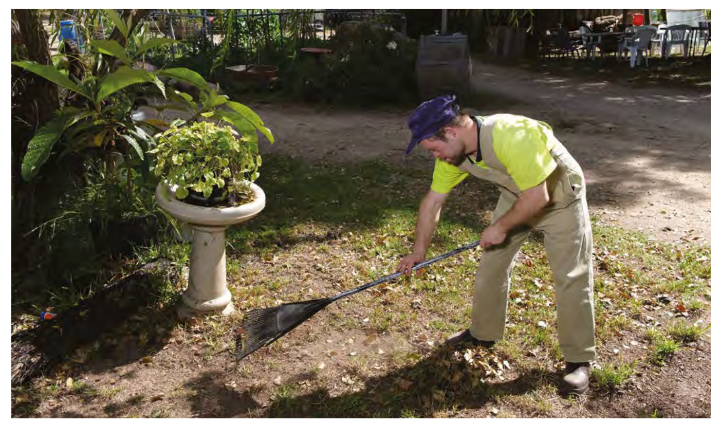
Employment is important for everyone.