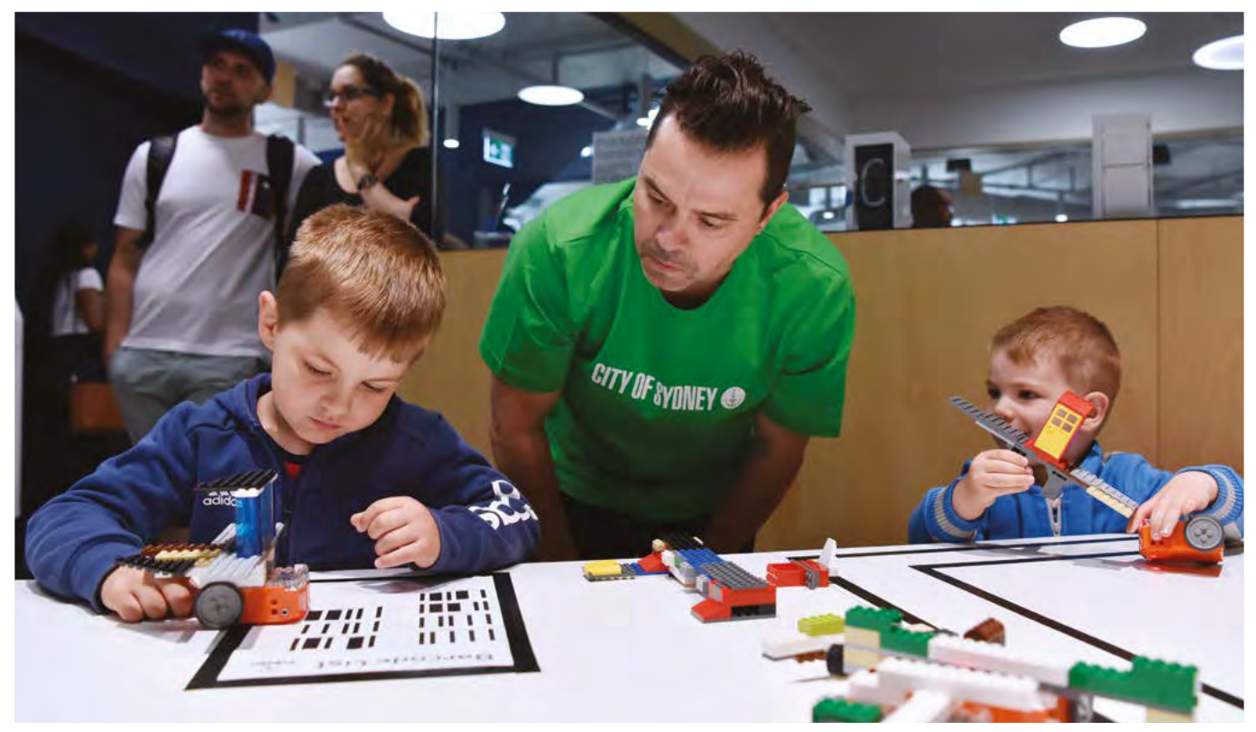
Darling Square Library Ideas Lab.