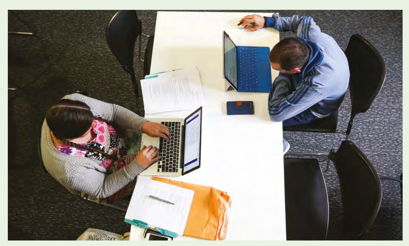
Workplace flexibility helps people manage the changing demands of work and personal life.