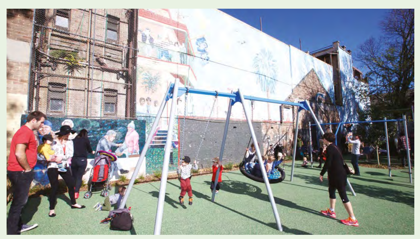
Inclusive bucket swing at Reconciliation Park, Redfern.