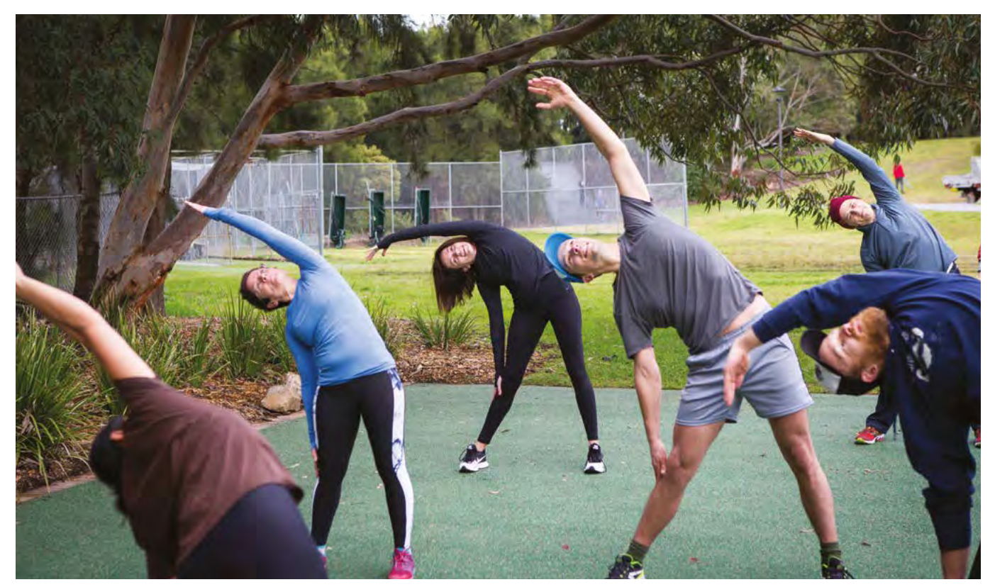
Group fitness at Sydney Park.