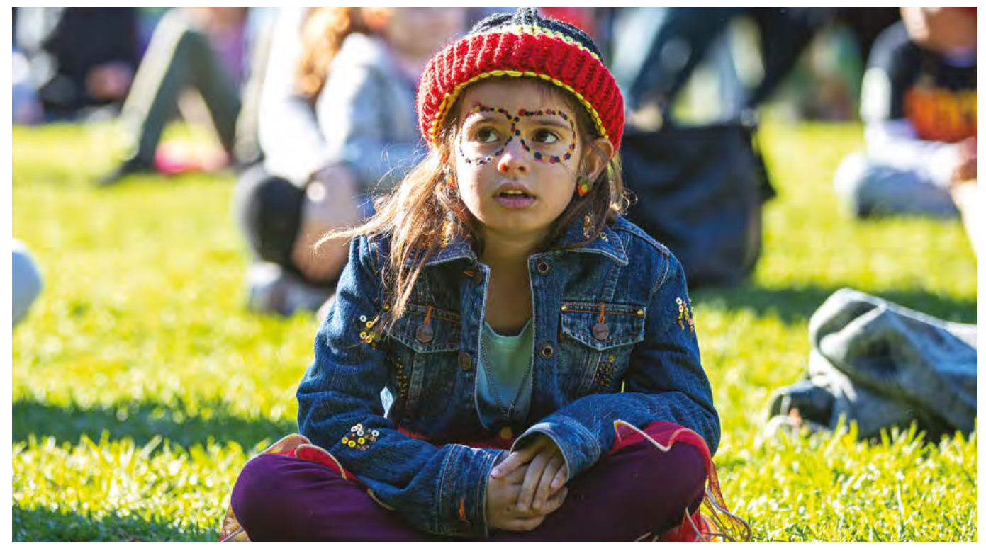
NAIDOC in the City 2019.

Sustainable Sydney 2030 recognises Sydney's Aboriginal heritage and contemporary Aboriginal and Torres Strait Islander cultures. Aboriginal and Torres Strait Islander communities in the City were extensively consulted for Sustainable Sydney 2030 and this consultation continues today. The City of Sydney is committed to acknowledging, sharing and celebrating a living culture in the heart of our city.