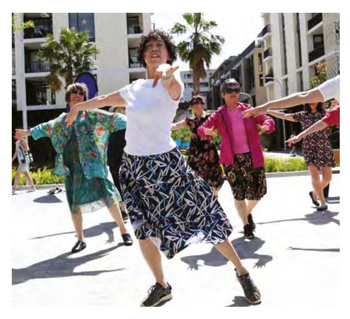
A group of older Asian women are performing Tai Chi with arms stretched out in a community square.

Over half of our residents are born overseas and 41 per cent speak a language other than English at home. This is reflected in the number of people living with disabilities – over 2,100 (or 42 per cent) of the City area residents who need assistance with core activities speak a language other than English at home.<sup>28</sup>