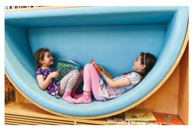
Green Square Library designed for all.

While it is important to identify specific actions to assist in the development of positive attitudes and behaviours, we know that actions under the other three strategic directions will also contribute to developing inclusive attitudes.