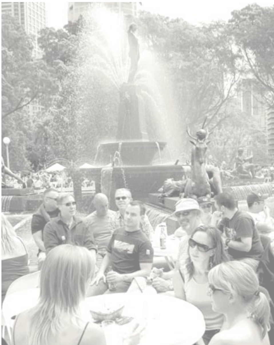
Clover Moore MP Lord Mayor of Sydney