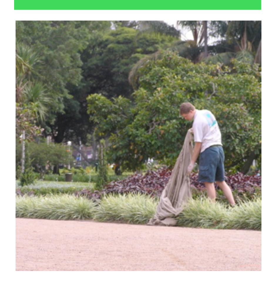
Prepared for City of Sydney May 2006

Interviews with service and amenity providers