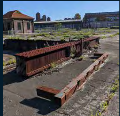
Markings and remnants of former activity on site

The ambition for this project is to reduce waste, and reuse site materials to reflect the history and character of the place.