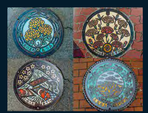
Japanese manhole covers