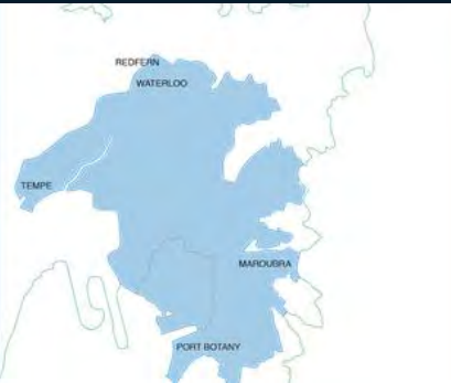
Map of the Botany Sands Aquifer drawn by Bangawarra, 2021.