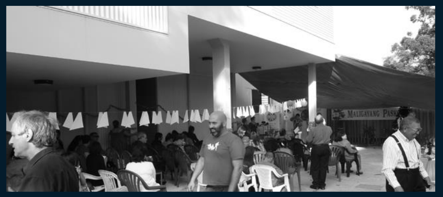
Example of a 'sheltered edge' of the built form. Annual street party, Kapitbahayan Filipino Housing Cooperative, Canley Vale. 2011. Architect Hugo Moline.

As a means of expanding the Open Field beyond the areas designated as public domain, the architectural design of built form elements may interpret the ground floor of buildings as a continuation of public space.