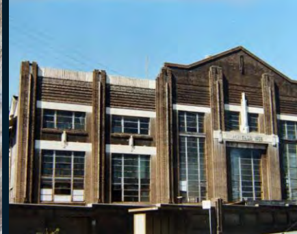
Art Deco style brick building enveloping the Waterloo Water Pumping Station

The freshwater Country now known as Waterloo has been an important place for travel, shelter and resources for the local Aboriginal people of Sydney for millennia.