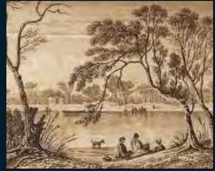
From Mud Bank Botany Bay - mouth of Cooks River 1830 By John Thompson. Collection of the State Library of New South Wales. [DL PXX 31, 2a] (Dixson Library)