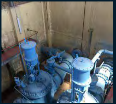
Sydney Water infrastructure