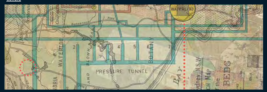
Historic maps with water network overlay

Critically important working infrastructure supplying water to the Eastern parts of the city operates on this site.