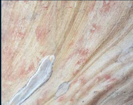
Red Hands cave on the Georges River.