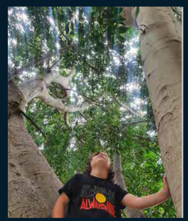
Providing space to learn the stories of Country.

The Stories of Country project is a basis for honouring Country, to remember and protect the many different stories of Country from across millennia, from the Nattai Bamalmarray (freshwater wetlands) to its recent industrial history into the future