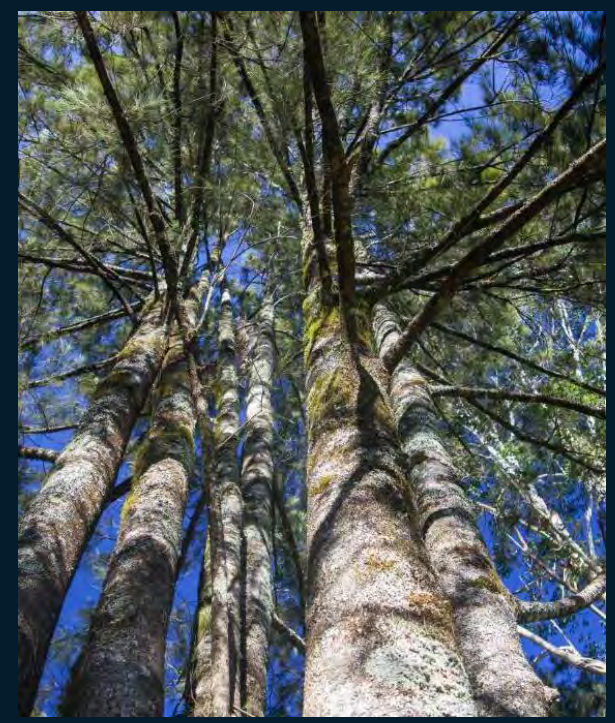
The shelter and protection of Dahl'wah.

Open spaces of the public domain need to be balanced with tree canopy for shade, biodiversity and climate mitigation - to provide shelter and feed the community.