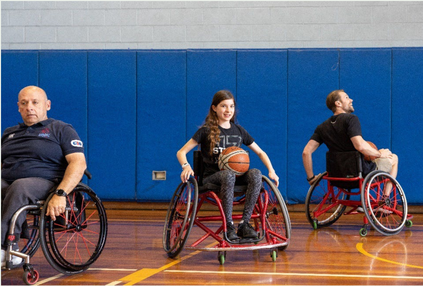
Photo: Wheelchair basketball at Ultimo Community Open Day 2022.