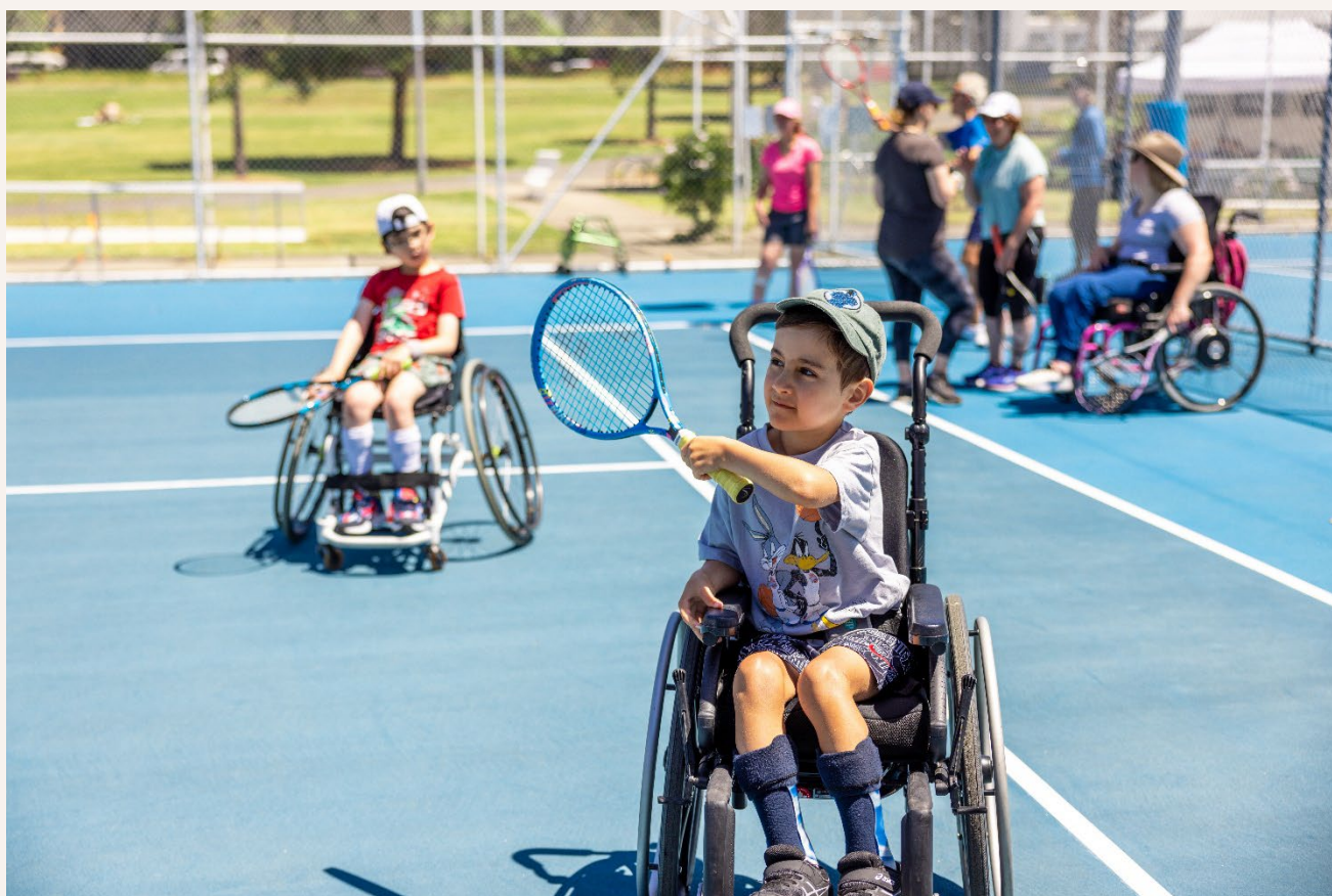
Photo: Young boy playing adaptive tennis using a wheelchair at Prince Alfred Park, Surry Hills.