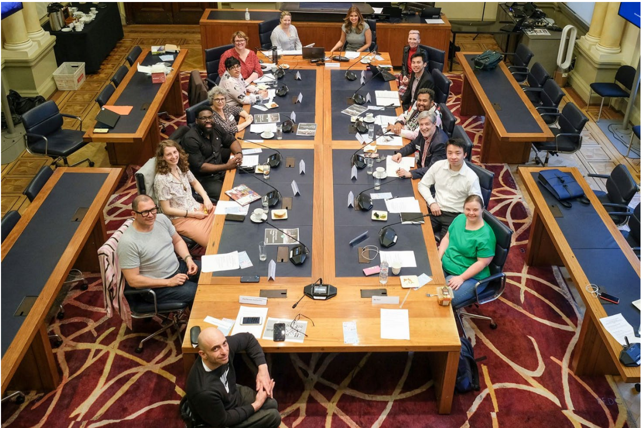
Photo: Group photo of the Inclusion (disability) advisory panel sitting at desks in Council Chambers.