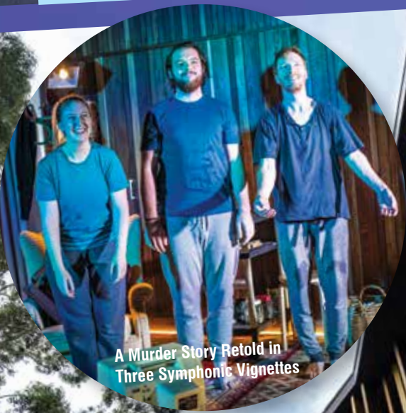
A Murder Story Retold in Three Symphonic Vignettes

CITY OF SYDNEY CREATIVE STUDIOS 119 BATHURST STREET Spanning five stories, the Creative Studios have double-height rehearsal studios with sprung floors, soundproof recording and rehearsal studios, production and editing suites and wet-dry floors, soundproof recording and rehearsal studios, production and editing suites and wet-dry floors, soundproof recording and rehearsal studios, production and editing suites and wet-dry floors for visual artists. There's an artist-in-residence apartment and a café. Not-for-profit charity Brand X Productions manage this affordable space, which is available for booking.