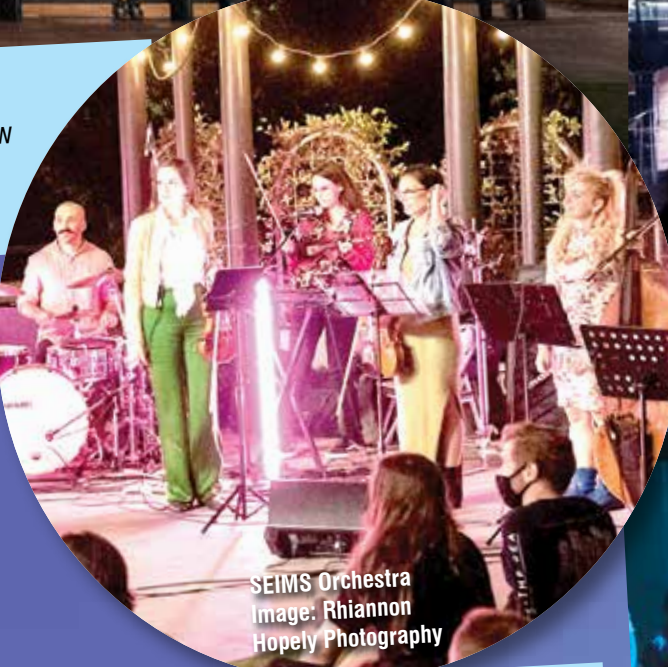
SEIMS Orchestra

CAPITOL THEATRE 13 CAMPBELL STREET, HAYMARKET This City owned world class theatre is on long term lease to Foundation Theatres. It has been a market, circus and hippodrome in its lifetime. Next year will see audiences enjoying big productions Chicago, Grease, Shen Yun and Alice in Wonderland.