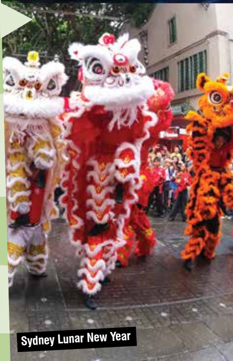
Sydney Lunar New Year