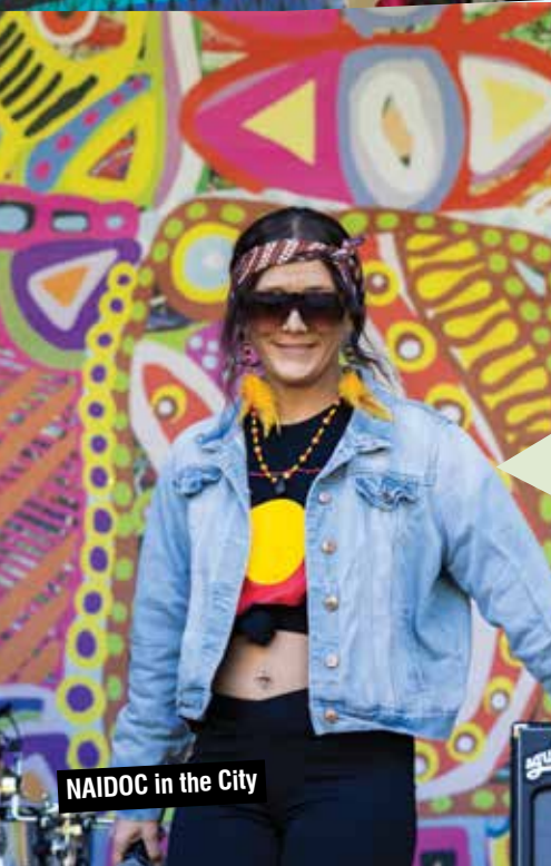
NAIDOC in the City