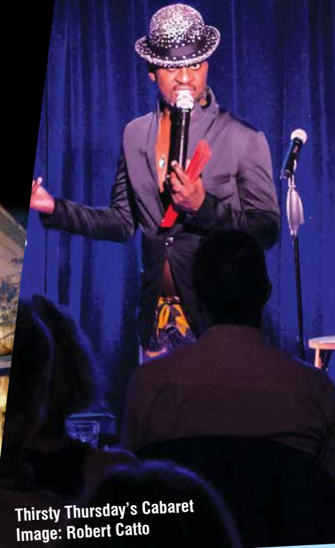
Thirsty Thursday's Cabaret

ETERNITY PLAYHOUSE 39 BURTON STREET, DARLINGHURST This is the home of the Darlinghurst Theatre Company, which collaborated on the design of this world-class performance venue. The former 129-year-old heritage-listed Burton Street Tabernacle took its title from the work of legendary Sydney artist, Arthur Stace, who chalked "Eternity" on the footpaths of Sydney after hearing a sermon there.