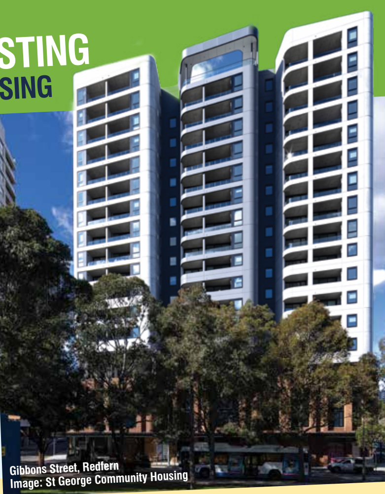
Gibbons Street, Redfern