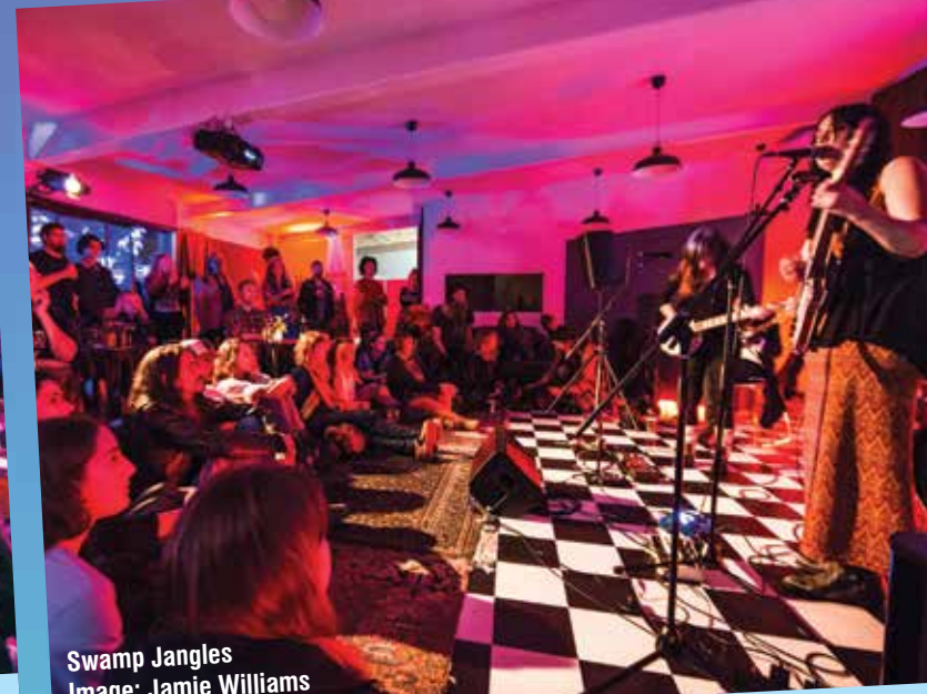
Swamp Jangles

CITY RECITAL HALL 2 ANGEL PLACE, SYDNEY The City is the principal sponsor of City Recital Hall, which presents a curated program of contemporary and classical music performances. It is a purpose-built live performance venue with world-class acoustics and a spatial surround system.