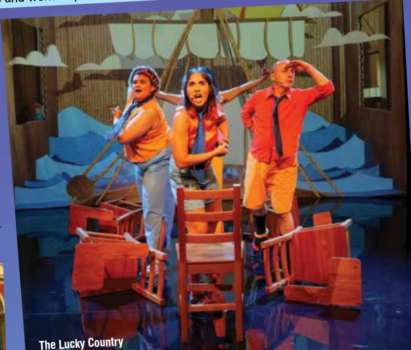
The Lucky Country

JOYNTON AVENUE CREATIVE CENTRE 3A JOYNTON AVENUE, ZETLAND The venue has several beautifully designed, award-winning community and event spaces. Formerly nurses' quarters within the South Sydney Hospital, this centre is now managed and curated by 107 Projects who provide affordable work spaces for small creative businesses and jewellery makers, host exhibitions and provide a program of events and workshops for the community including regular arts and crafts markets.