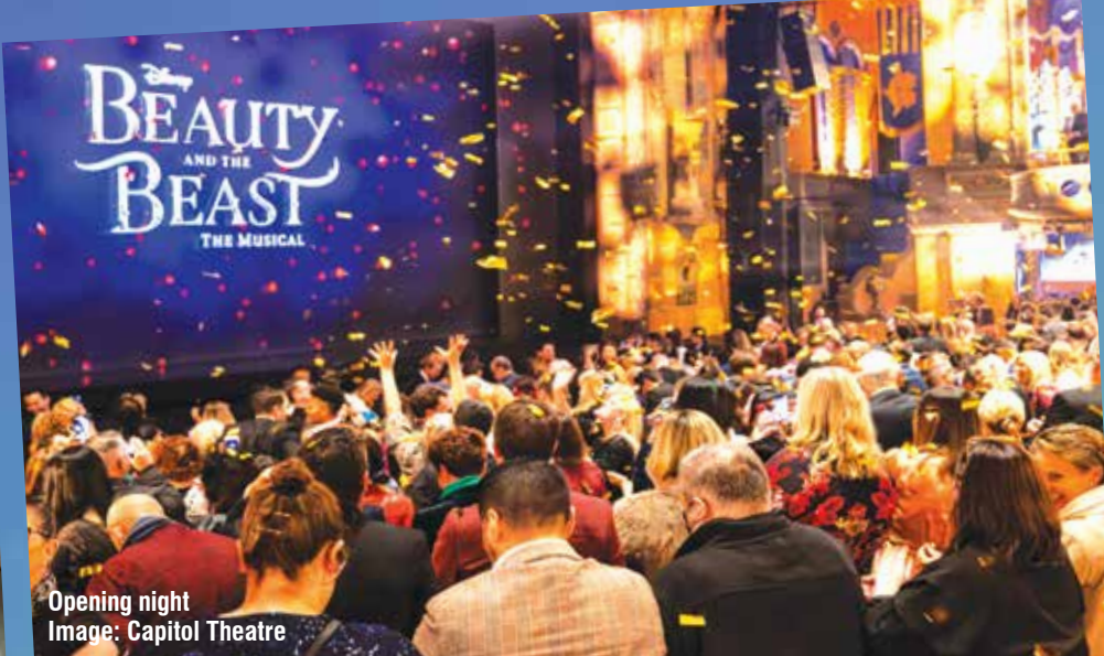
Opening night

LOCAL ABORIGINAL KNOWLEDGE AND CULTURE CENTRE 119 REDFERN STREET, REDFERN Opening later this year, this new centre has 2 levels with a range of spaces for community use. It's located in the heart of Redfern, near other community and cultural services.