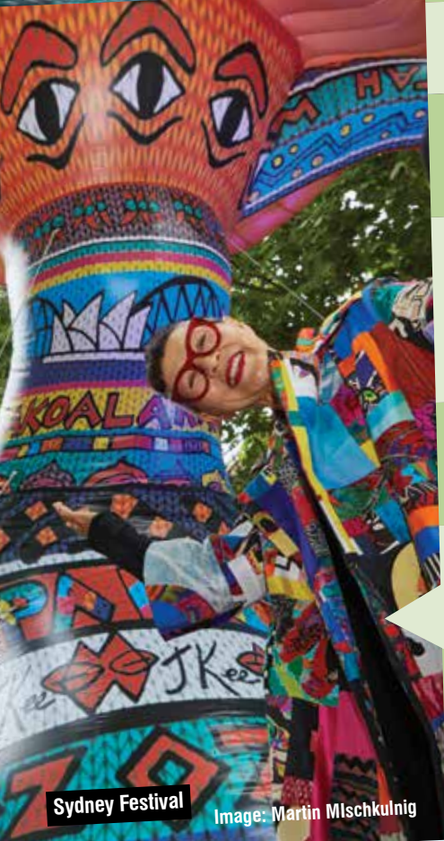
Sydney Festival