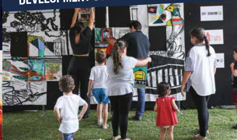
Green Square welcome party

The City has raised $384 million in levies from market housing developers, which has been passed on to community housing providers to deliver 854 homes, including at: