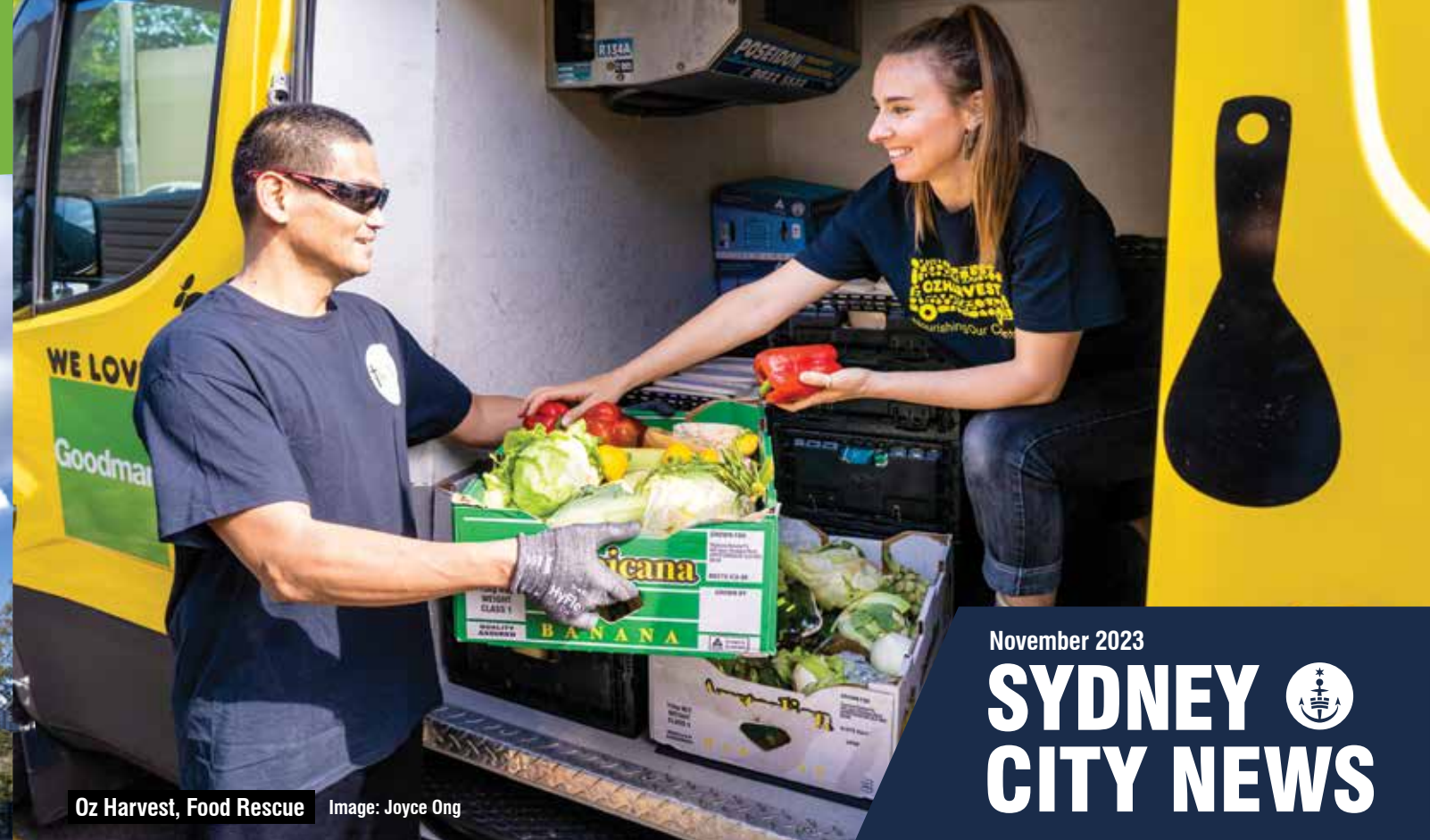
Oz Harvest, Food Rescue

City of Sydney: 02 9265 9333 council@cityofsydney.nsw.gov.au Translating & Interpreting Service (TIS): 13 14 50