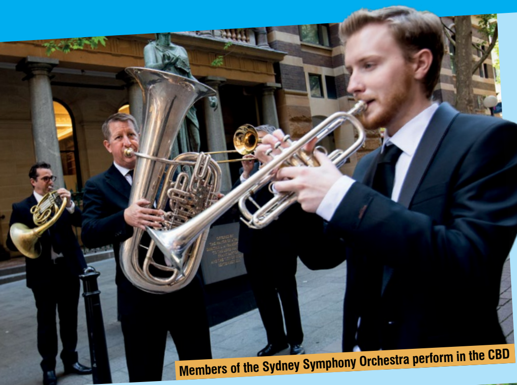
Members of the Sydney Symphony Orchestra perform in the CBD

With the NSW Government's financial support, we're planning outdoor cultural experiences in various locations around our city. This includes al fresco dining, live music and performance, and late opening hours for museums and galleries. This builds on our long-term work pre-Covid to create a 24-hour economy.