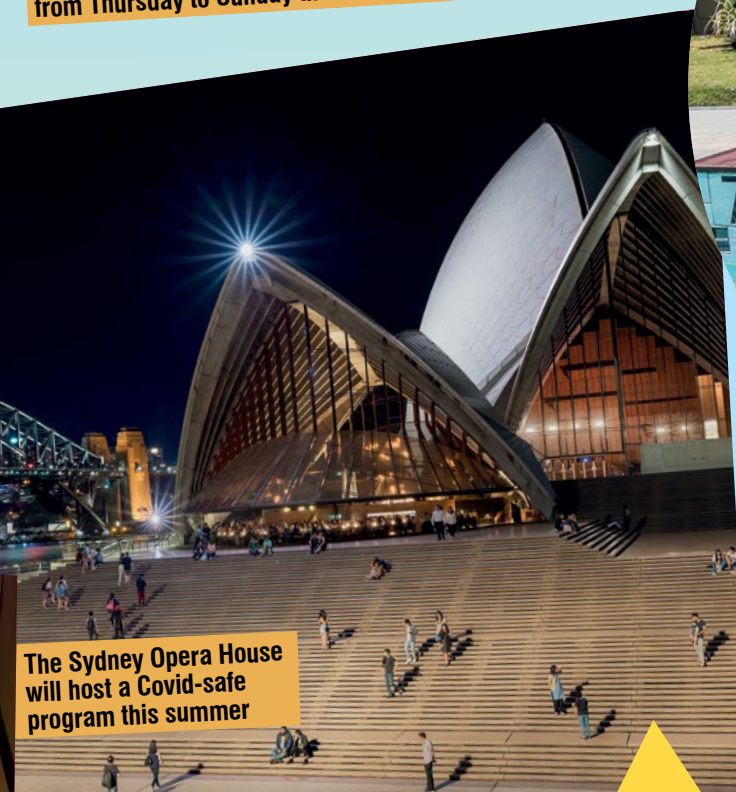
The Sydney Opera House will host a Covid-safe program this summer

Visit cityofsydney.nsw.gov.au for more info.