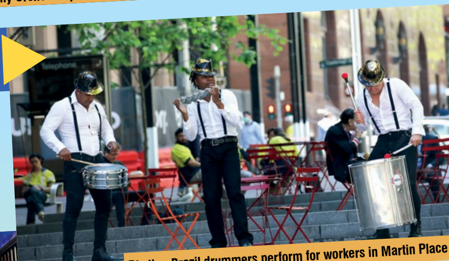
Rhythm Brazil drummers perform for workers in Martin Place

From 24 November, we are programming live music performances in the city centre every lunchtime from Tuesday to Friday until Christmas Eve. There will be a new program in the New Year. And, we are setting up a stage in the CBD from January 2021 to present a program of live music and performance, supporting our city's small and large arts organisations.