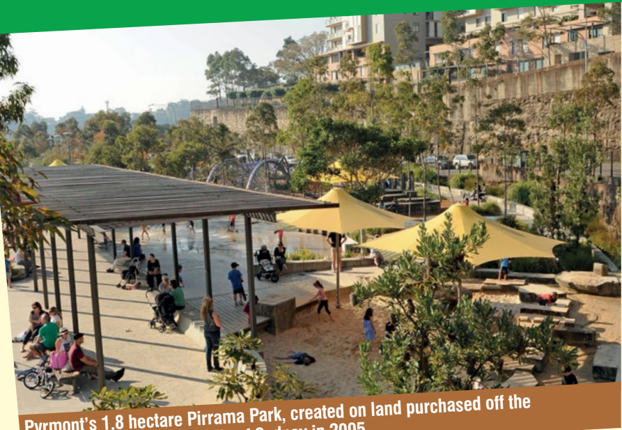
Pyrmont's 1.8 hectare Pirrama Park, created on land purchased off the NSW Government by the City of Sydney in 2005

Pyrmont Ultimo is the third densest village in Sydney, so we argued further development must be served by adequate public transport and increased open space. We also called on the NSW Government to deliver a Pyrmont Metro Station and return Wentworth Park to the people as parkland, earlier than 2027.