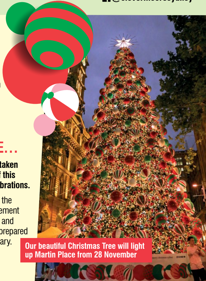
Our beautiful Christmas Tree will light up Martin Place from 28 November