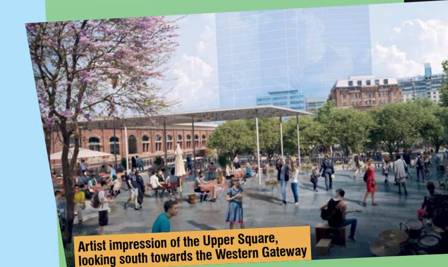
Artist impression of the Upper Square, looking south towards the Western Gateway

Tech Central stretches from Central Station to Camperdown, including South Eveleigh, and Central Square is located between Central Station and along Pitt Street and Broadway. And while most of Central Station and its surrounds is a designated State Significant Precinct, the land for the proposed Central Square is owned by both the NSW Government and the City of Sydney.