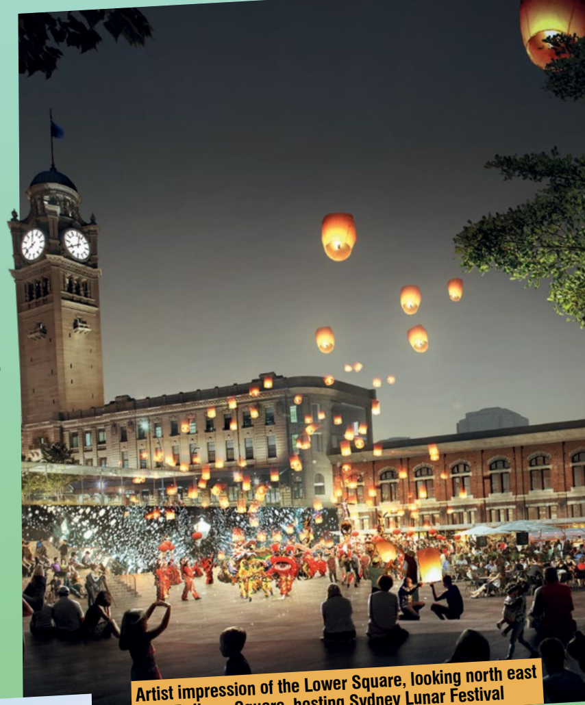
Artist impression of the Lower Square, looking north east from Railway Square, hosting Sydney Lunar Festival

Central Square will provide circulation and recreation space for the 450,000 people expected to pass through Central Station every day by 2036, as well as the 25,000 people working at Tech Central, including Atlassian's new headquarters.