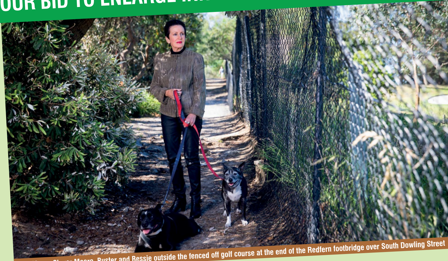
Lord Mayor Clover Moore, Buster and Bessie outside the fenced off golf course at the end of the Redfern footbridge over South Dowling Street

Our increasing population highlights the need to enlarge inner city parklands for the current and future physical and mental wellbeing of our constituents.