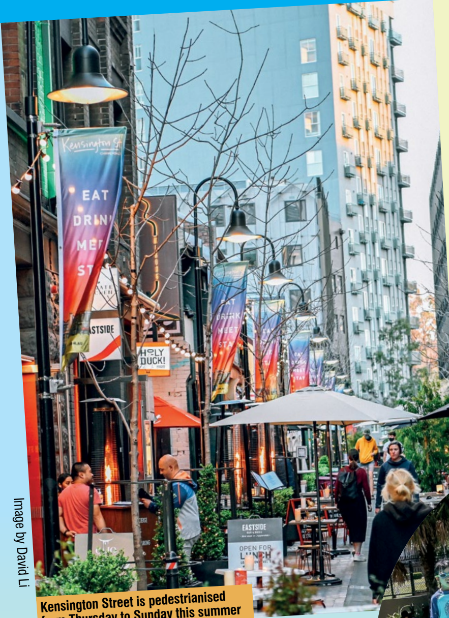
Kensington Street is pedestrianised from Thursday to Sunday this summer