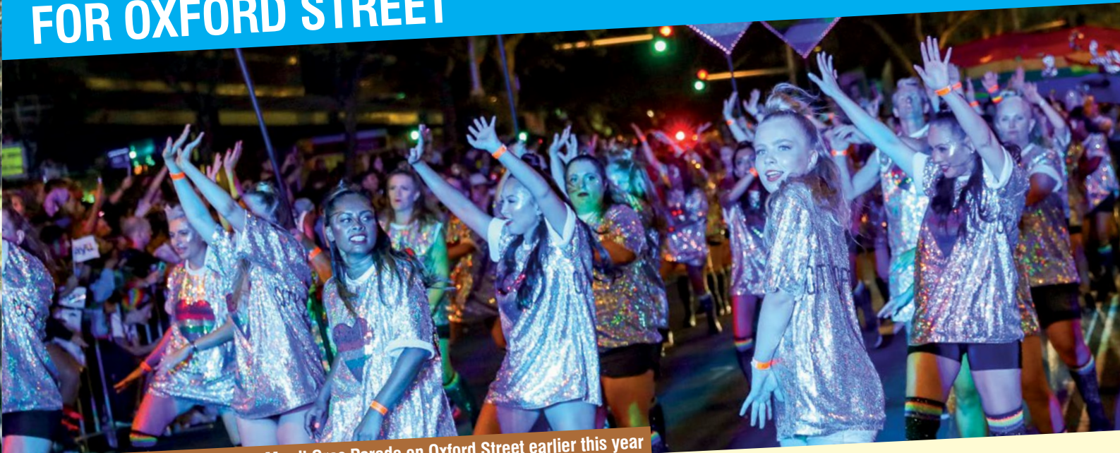
City of Sydney staff take part in the Mardi Gras Parade on Oxford Street earlier this year

We are reviewing the planning controls for the cultural and creative precinct in and around Oxford Street.