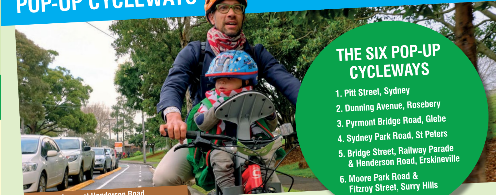
Pop-up cycleway at Henderson Road.