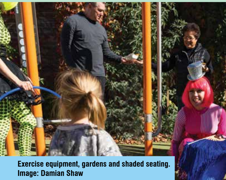
Exercise equipment, gardens and shaded seating.

This beautiful upgrade includes a nest swing, slide mound and nature play. There is new turf, more native plants and trees that will increase canopy for shade. We've added extra seats in both the sun and under trees, a wider footpath on Minogue Crescent, and an improved boundary with the PCYC.