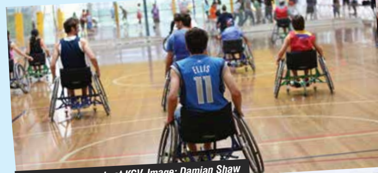
Multipurpose courts at KGV.

The new school is a City/State partnership and will have facilities for community use including a hall, multi-purpose court and meeting rooms. They will be used by the school by day and available for the community after hours.