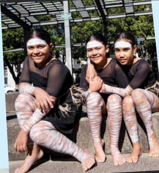
Brolga Dance Academy performers at Redfern Community Centre