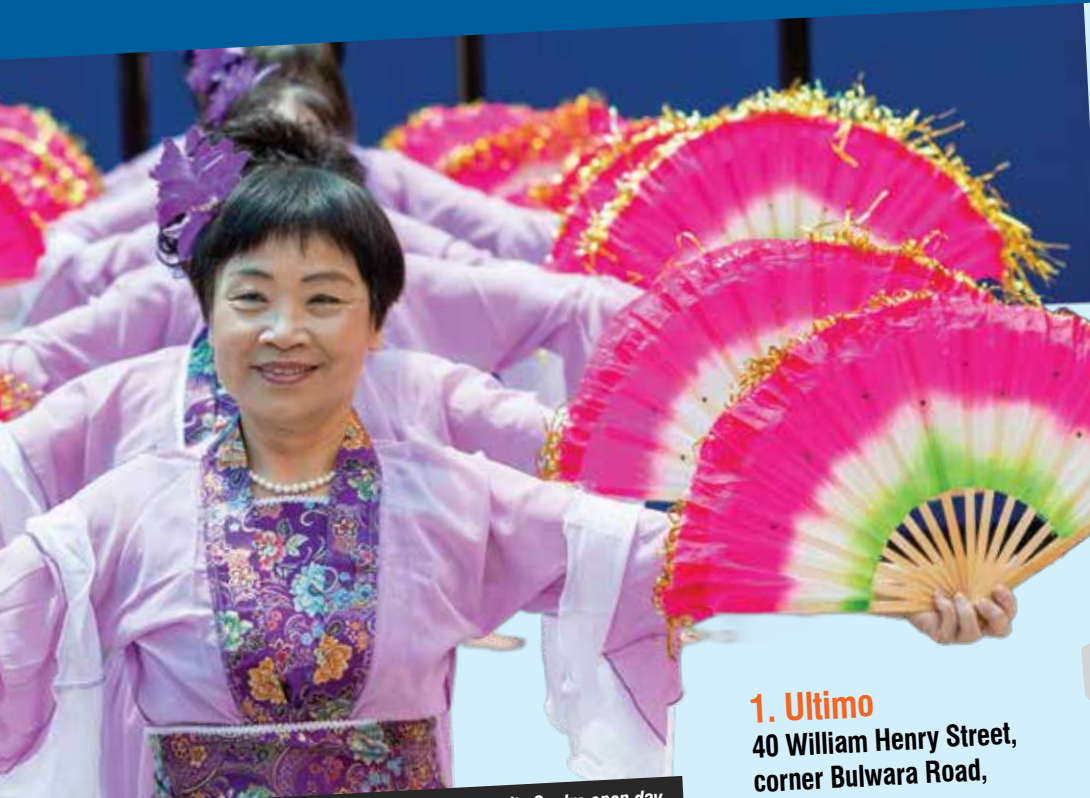
A spectacular dance performance at the Ultimo Community Centre open day