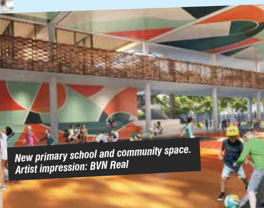
New primary school and community space. Artist impression: BVN Real