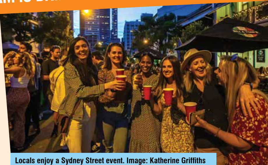
Locals enjoy a Sydney Street event.

This is also true for our night-time economy which is currently at 97% of 2019 levels. However, CBD visitation is recovering more slowly at 81% of pre-Covid levels. Our street parties and expanded outdoor dining and events are playing an important role in our return to normality. Head to the City of Sydney website to read the full report.