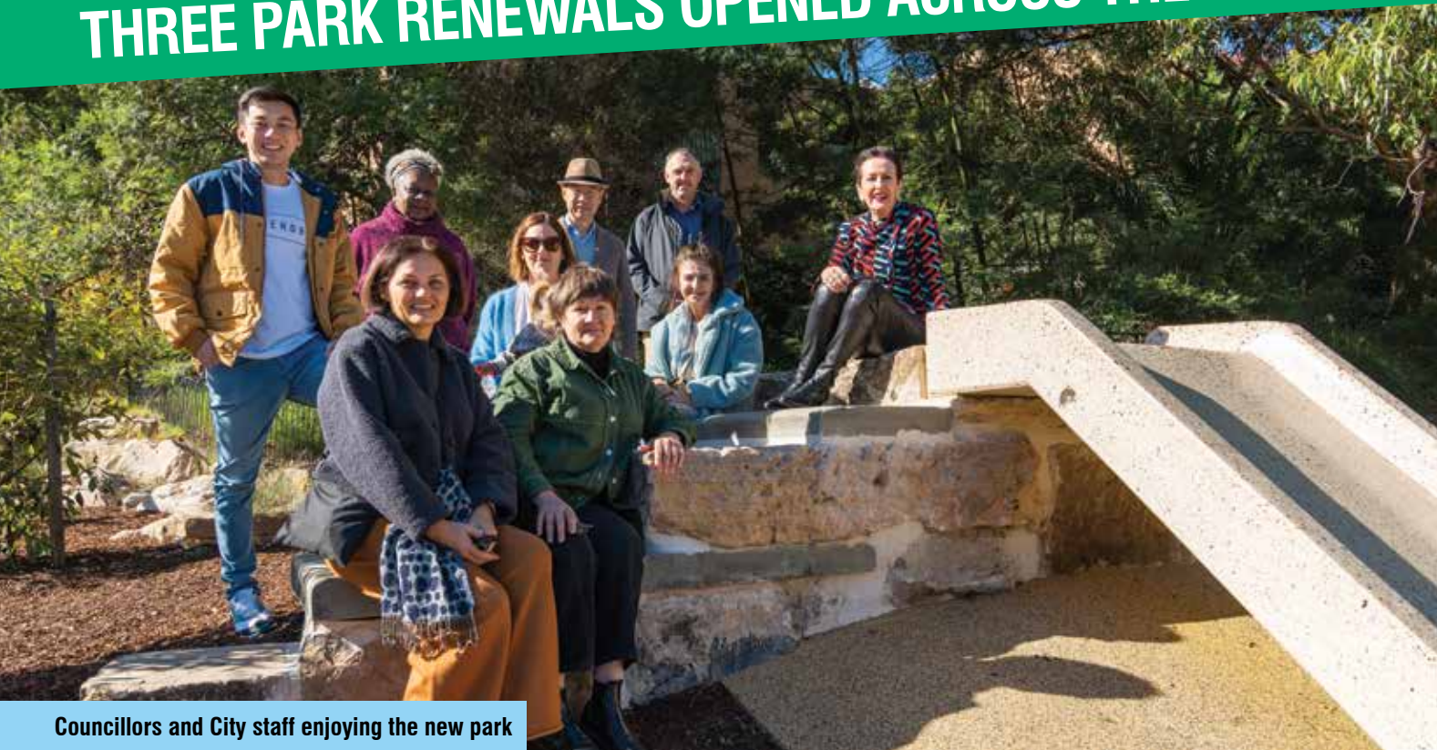
Councillors and City staff enjoying the new park