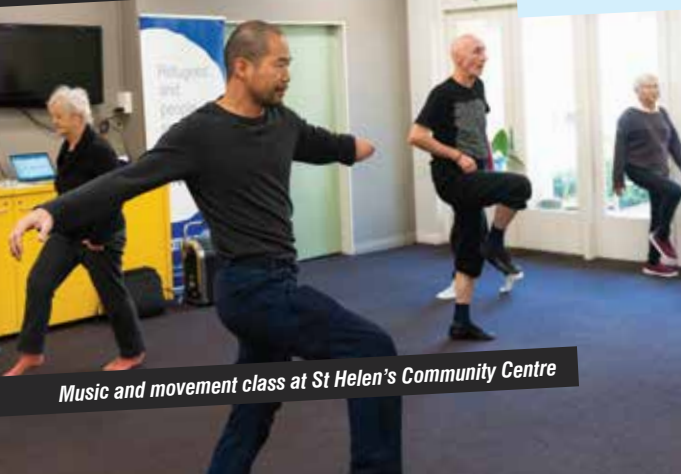
Music and movement class at St Helen's Community Centre

Our community centres are vibrant hubs for people to come together. They offer inclusive activities, hireable spaces, and services for our diverse communities.