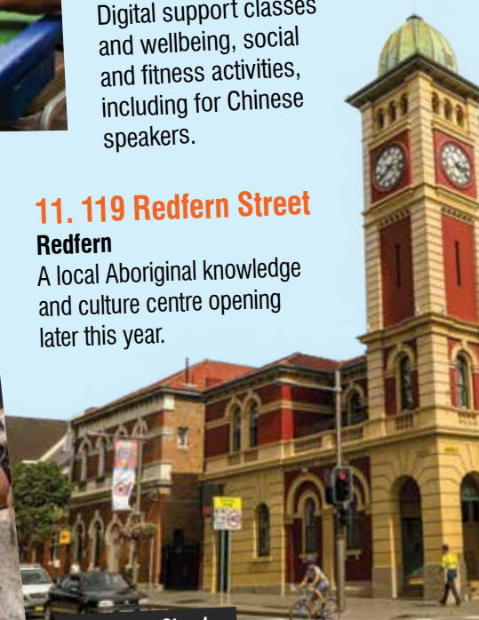
119 Redfern Street