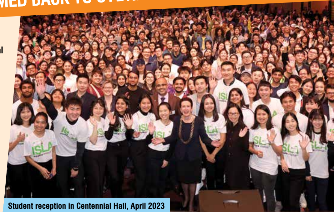
Student reception in Centennial Hall, April 2023

These receptions can inspire new journeys and hopefully life-long connections with our city.