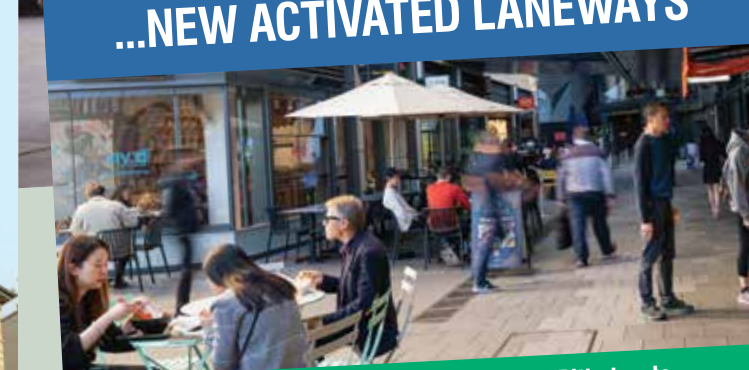
Enjoying outdoor dining between George and Pitt streets