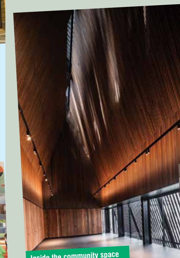
Inside the community space