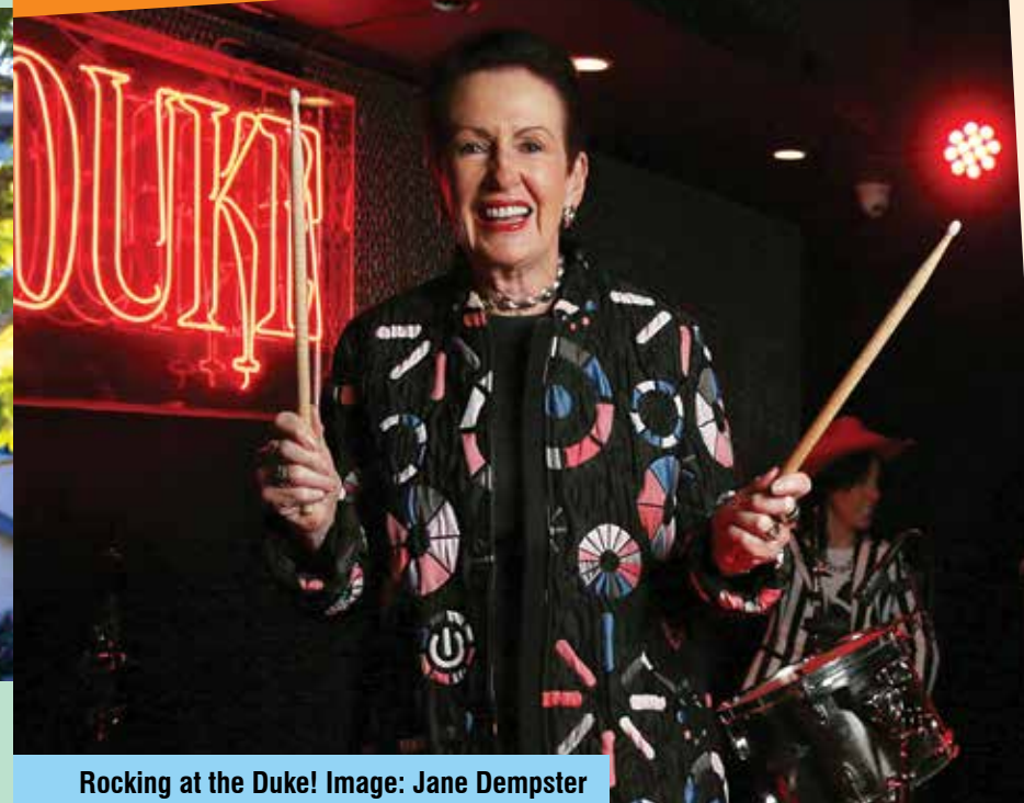
Rocking at the Duke!

Live music is an essential pillar of our $5 billion night time economy.