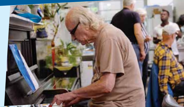
Piano for community use at Reginald Murphy Community Centre

14. Green Square Public School and Community Spaces Opening early 2025 The new school is a City/State partnership and will have facilities for community use including a hall, multi-purpose court and meeting rooms. They will be used by the school by day and available for the community after hours.