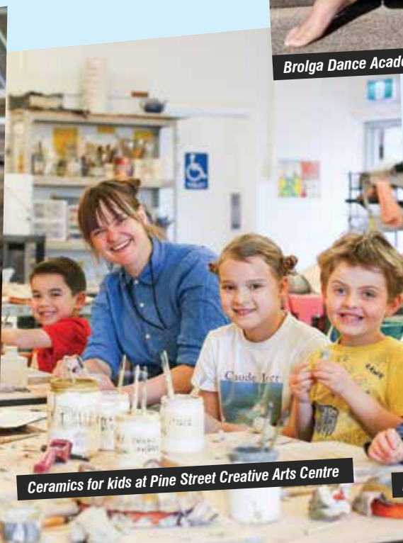
Ceramics for kids at Pine Street Creative Arts Centre