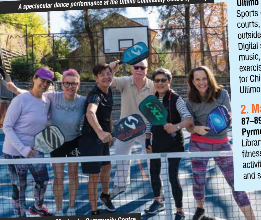
Pickle ball at Maybanke Community Centre