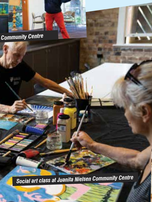
Social art class at Juanita Nielsen Community Centre