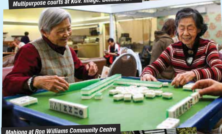
Mahjong at Ron Williams Community Centre