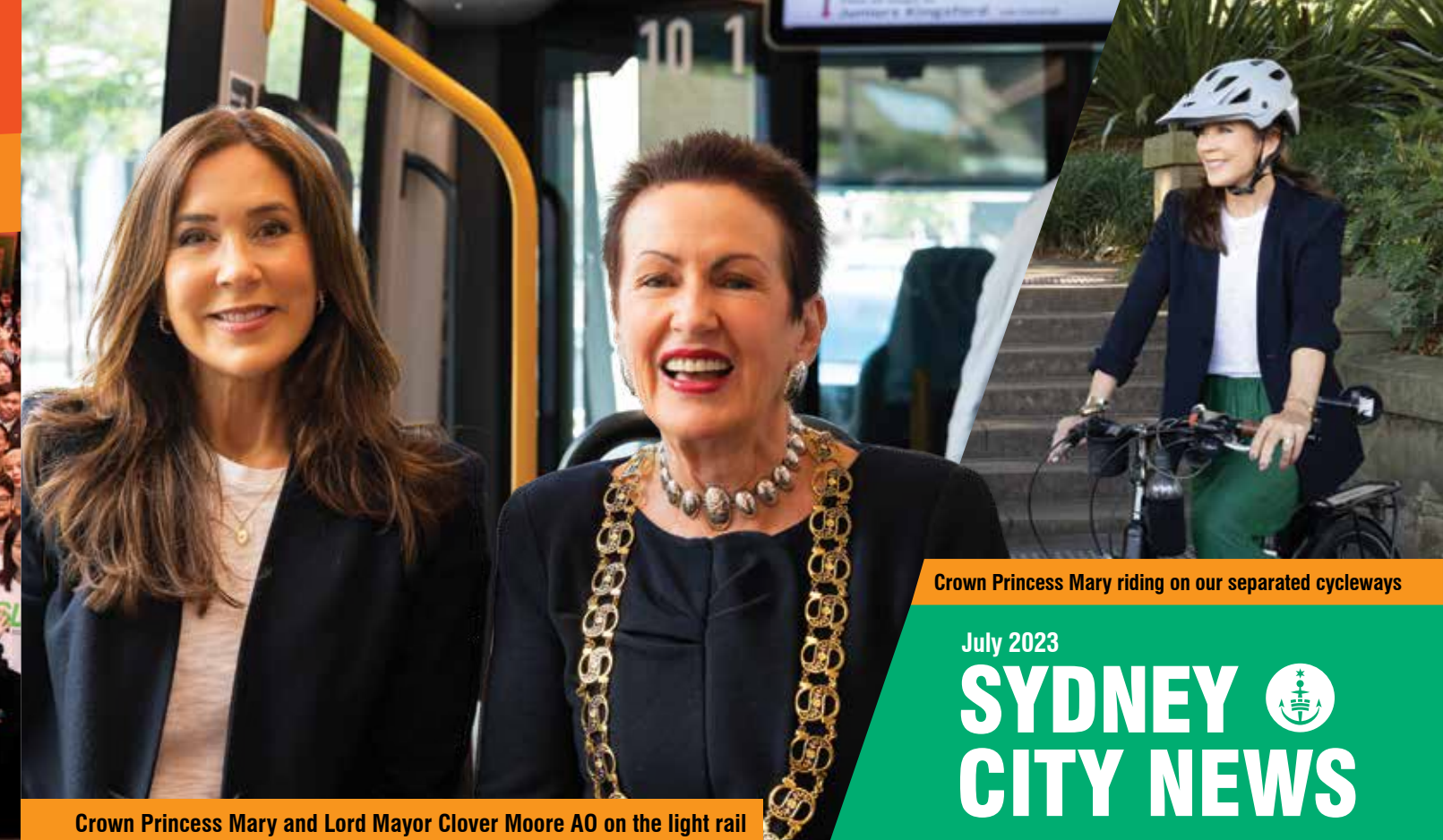
Crown Princess Mary and Lord Mayor Clover Moore AO on the light rail

City of Sydney: 02 9265 9333 council@cityofsydney.nsw.gov.au Translating & Interpreting Service (TIS): 13 14 50