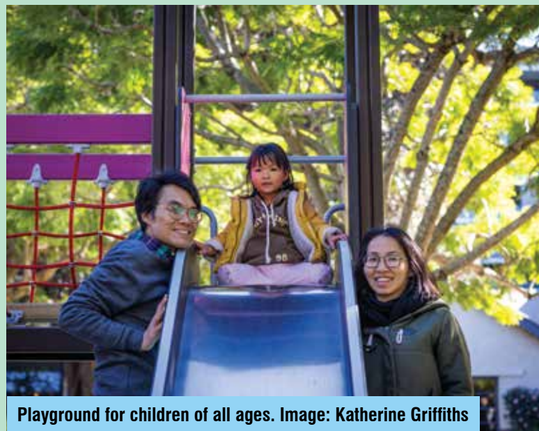
Playground for children of all ages.

Locals can now enjoy new fitness equipment and more seating when they visit Lyons Road Park. We've planted trees and left an area for a future community garden. Footpaths and connections between Lyons Road and Lambert Street have also been improved.