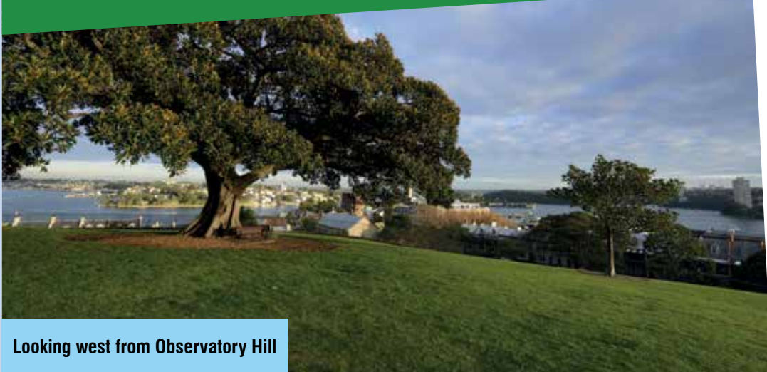
Looking west from Observatory Hill

Modification 9 for Central Barangaroo has been referred back to the proponents by the Minister for Planning. This was after widespread objections from the community, heritage authorities and the City. In the original plans this area provided public space with cultural opportunities. Given the substantial increases in site development, building heights, and the extensive privatisation of the harbour foreshore, the State Government should salvage some of that lost public benefit originally envisaged for the site.