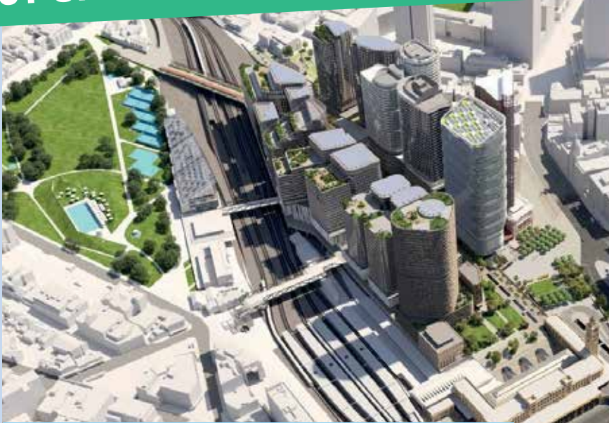
The proposed Transport for NSW plans for Central station precinct

The State Government plans for the Central station precinct – to be largely built over rail lines at Central Station – have been revealed, including a public presentation by Transport for NSW at Sydney Town Hall. As an important part of the Tech Central innovation precinct, the stated aims of this development are to develop and encourage high-tech industries of the future, providing laboratories for innovation and research, in fields like medicine, AI, climate and ecological sciences. The Atlassian headquarters are already approved for the area. The design will not impact on Prince Alfred Park or the Greek Orthodox Church. Finally, respect for heritage and design excellence must apply to this project. The Central station precinct should be just as special as the existing sandstone buildings that have served and enhanced our City for more than a century.