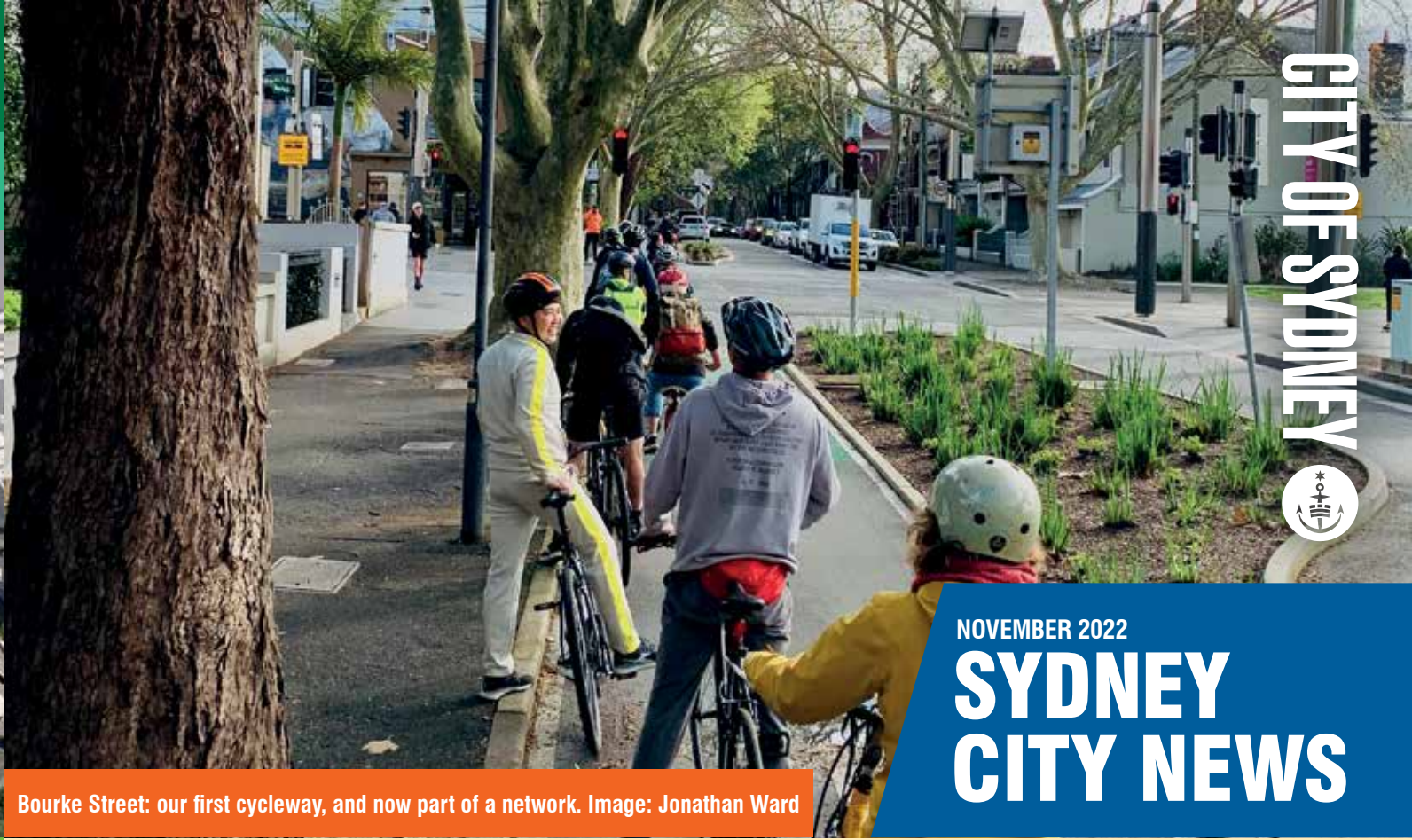
Bourke Street: our first cycleway, and now part of a network.

City of Sydney: 02 9265 9333 council@cityofsydney.nsw.gov.au Translating & Interpreting Service (TIS): 13 14 50