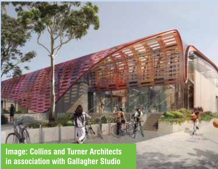
Image: Collins and Turner Architects in association with Gallagher Studio

Refurbishment of the community centre will include a new lift, entry foyer, ground floor toilets, gym, community rooms, and an upgrade of the out-of-school-hours care facility. There will also be an upgrade to the main community hall, library link, and level one community room. The project also includes a comprehensive fire services upgrade.