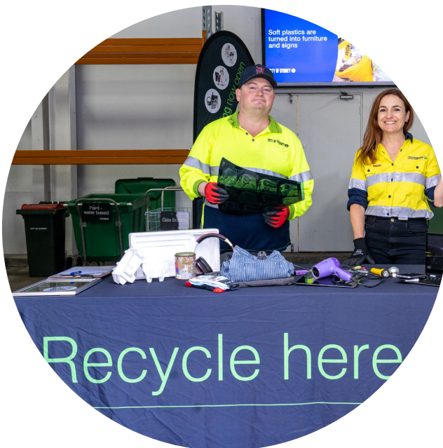
Bottom Image: Ultimo recycling pop-up event