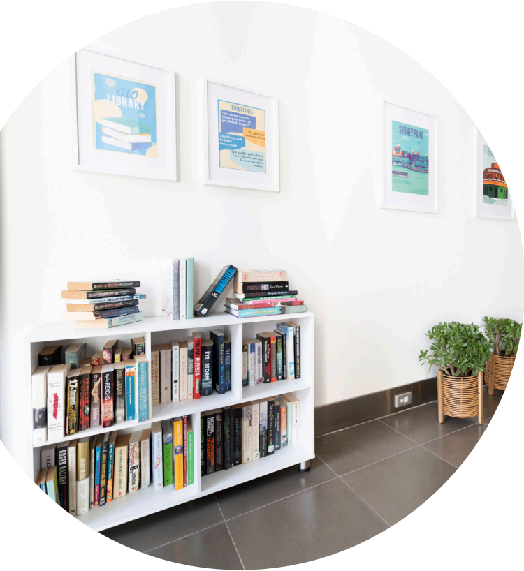
Image: Glo apartments foyer

Go above and beyond with these great initiatives