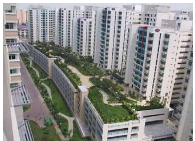
Punggol Singapore Green Roof

Toronto Has supported green roofs with technical guidelines, workshops, demonstration sites, grants and subsidies. In 2009 Toronto City Council bought in a mandatory green roofs by law for all developments over 2,000 square metres. Prior to the by law Toronto had around 36,000 square metres of green roofs. In the few years since the bylaw was introduced, more than 170,000 square metres of green roofs are planned or under construction.