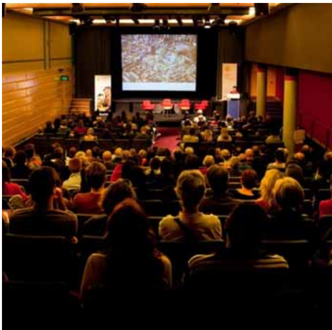
Green roofs and walls forum Sydney Design Festival

Regularly review and update the City's green roofs and walls webpage with new information.