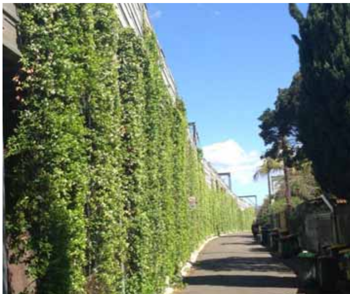
Macdonaldtown rail bridge – green facade

Actively participate in the City of Sydney Greening Sydney meetings and activities.