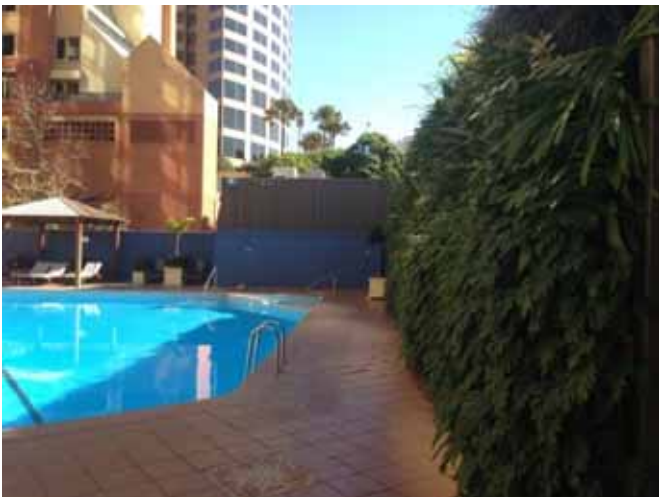
Four Seasons Hotel – Pool side green wall

Research being conducted (see below) will also help clarify the specific environmental, social and economic benefits of green roofs and walls as an important comparison to the overall costs.