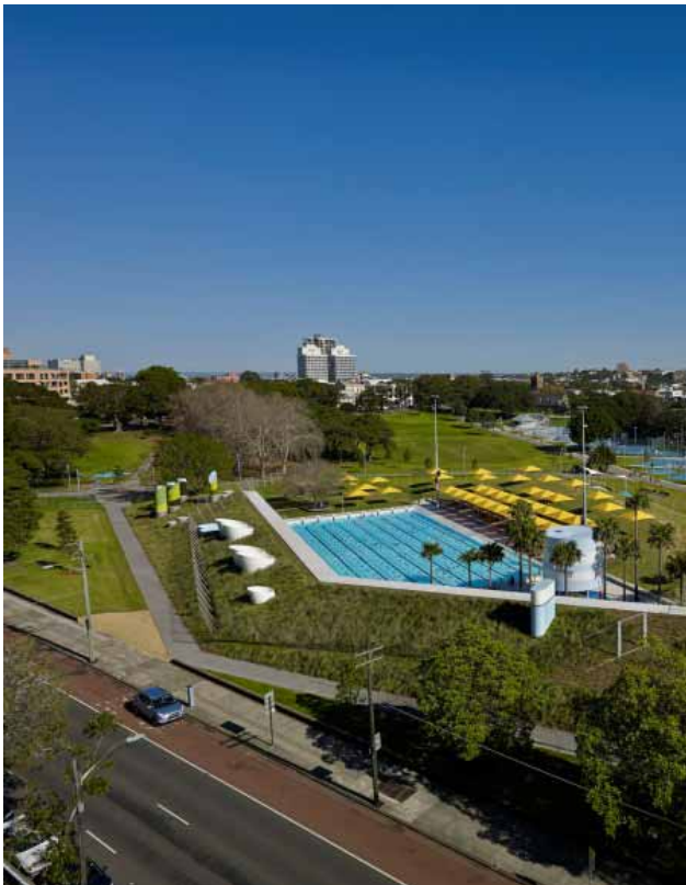
Prince Alfred Park Pool – 2,000m 2 green roof

Currently the City has seven green roofs and five green walls that are owned by or under the care and control of the City. The City has won architectural awards for two of its green roof developments at the Surry Hills Library and the Prince Alfred Park Pool.