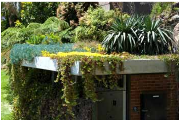
Beare Park amenities block, Elizabeth Bay

The City will continue to take an active leadership role in the development of green roofs and walls in Sydney and nationally through the development and adoption of a Green Roofs and Walls Policy and through the actions provided in this Implementation Plan.