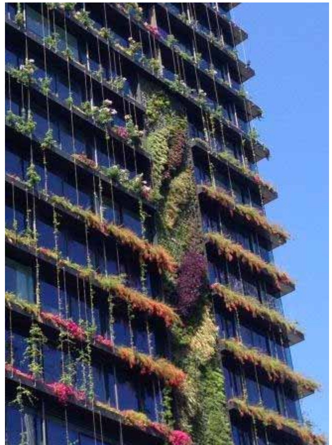
1 Central Park - Broadway