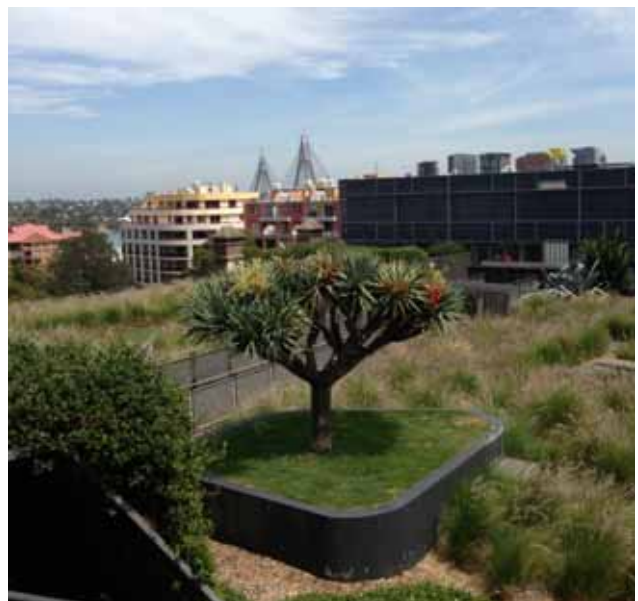
M-Central – Green Roof - Ultimo

The majority of green roofs in Sydney are a mix of intensive (deep) and extensive (shallow) plantings. A good local example is M Central at Ultimo. Deep and shallow landscapes are combined with water features, barbecues and pathways to create a beautiful open parkland area for residents and visitors.