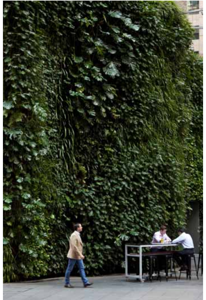
1 Bligh Street – Sydney central business district

A more detailed list of actions and timeframes for implementing the policy is provided at Appendix A.