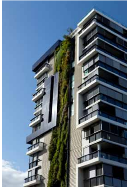
Trio Apartments - Camperdown

Research proving the environmental benefits of green roofs and walls in Sydney will be important in advancing the recognition of green roofs and walls within planning controls and rating systems.