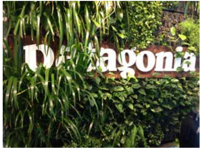
Indoor green wall - Patagonia store

Living walls are more complex systems where panels or pockets are fixed directly to the wall and plants grown in the pockets. These systems often use very little soil to minimise the weight load on the walls. Instead plants are fed through nutrients in the irrigation water. One of the best local examples is the 1,100 square metre series of living wall panels on the Central Park development on Broadway. Similar systems are installed in the Patagonia store in Bathurst Street, (indoor).