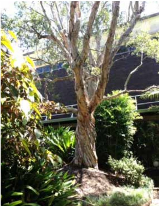
The former Readers Digest building – Surry Hills

The City of Sydney recognises the significant benefits green roofs and walls can provide our city. Incorporating plants into building design creates a city that is more beautiful, liveable and resilient to a changing climate.