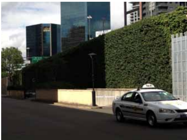
Cumberland Street – The Rocks

These are simple systems where plants are grown directly into soil and trained up a frame or trellis system to cover the wall. Plants can be grown directly in the ground, or in containers or planter boxes installed on the ground or at intervals on the wall. A typical example is the Cumberland Street wall pictured below, which covers the access to the Sydney Harbour Bridge.