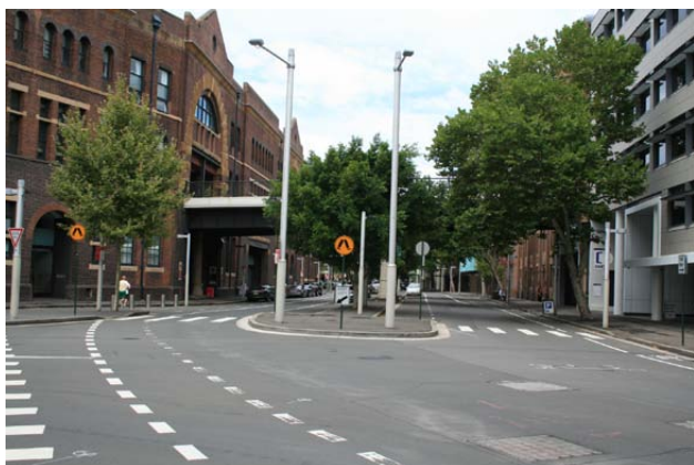
Figure 48- Hickson Road retain Ficus hillii median but include Livistona and Platanus as the verge plantings.

This precinct includes the eastern foreshore between Cockle Bay and Walsh Bay, adjacent to the sandstone cliffs of Millers Point, and is to be redeveloped as Barangaroo over the coming years. Design outcomes here may dramatically alter the streetscape and associated street tree plantings.