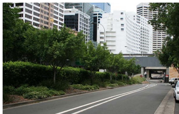
Figure 49- Retain Ficus hillii on Shelly street adjacent to freeway but thin to allow trees to develop.