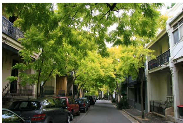
Figure 71- Several streets with Golden Robinias create a very unique character.