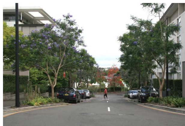
Figure 67- Jacaranda trees in the recently planted Alexandra Drive.