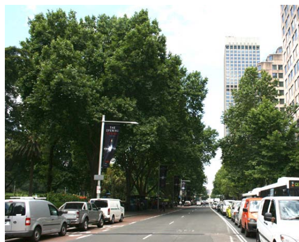
Figure 55- The borrowed landscape from Hyde Park boundary planting provides a strong contribution to surrounding streets.