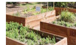
Existing garden beds