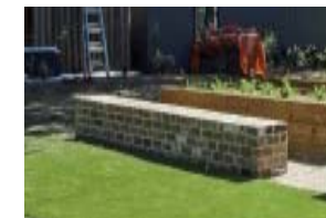
Brick retaining wall