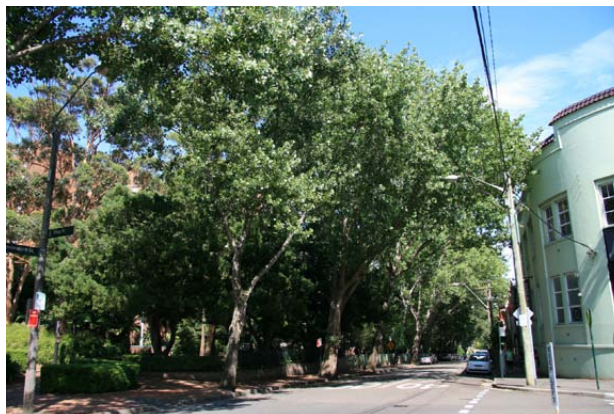
Figure 59- Mature Cottonwood Poplars on Devonshire Street.