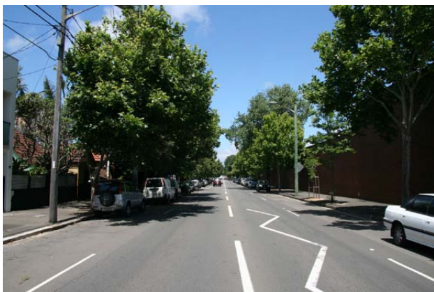
Figure 84- Mitchell Road with an establishing avenue of Plane trees and Green Ash.

In residential streets there are a range of young and established trees, predominantly natives. Mitchell Road runs through the middle of the precinct and acts as a central spine with an establishing avenue of Plane Trees and Green Ash. Several streets have had recent street upgrade works completed which have provided road blisters for tree planting. Many streets still contain Paperbark trees planted in the 1970's.