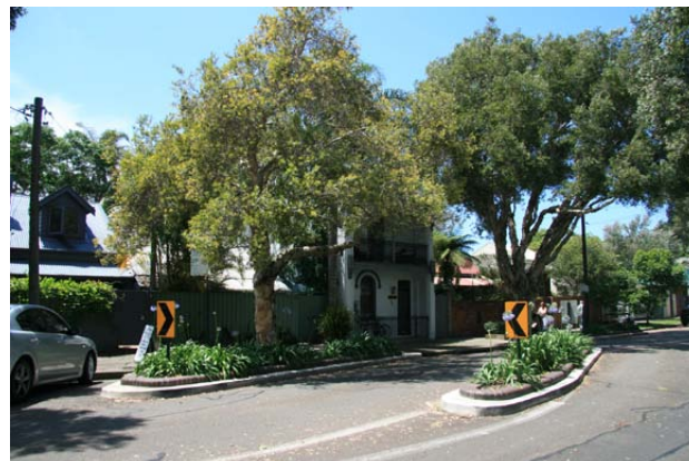
Figure 85- Road blisters provide opportunities for tree planting.